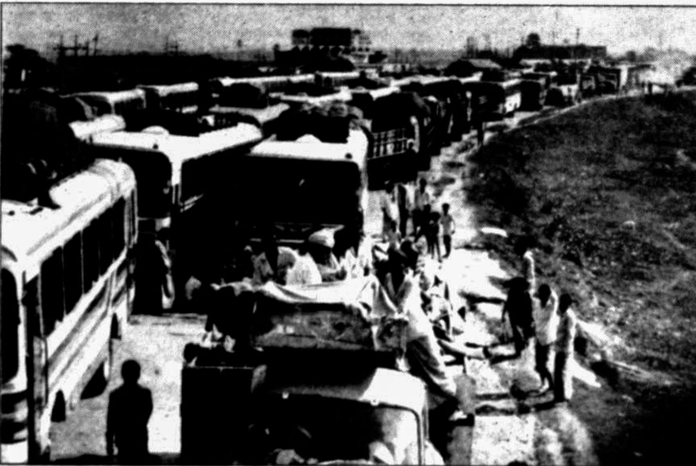
CARAVAN COMES TO A HALT: Three mile long queue of buses and trucks on Dhaka-Chittagong Road in the wake of jute and textile mills workers programme yesterday.

bands held rallies and processions and squatted on tracks and roads. Newspaper services to some northern and southern districts were suspended. A bus carrying newspapers was obstructed at Kanchpur point early morning Tuesday, damaged and forced to turn back. See Page 12 Col. 2