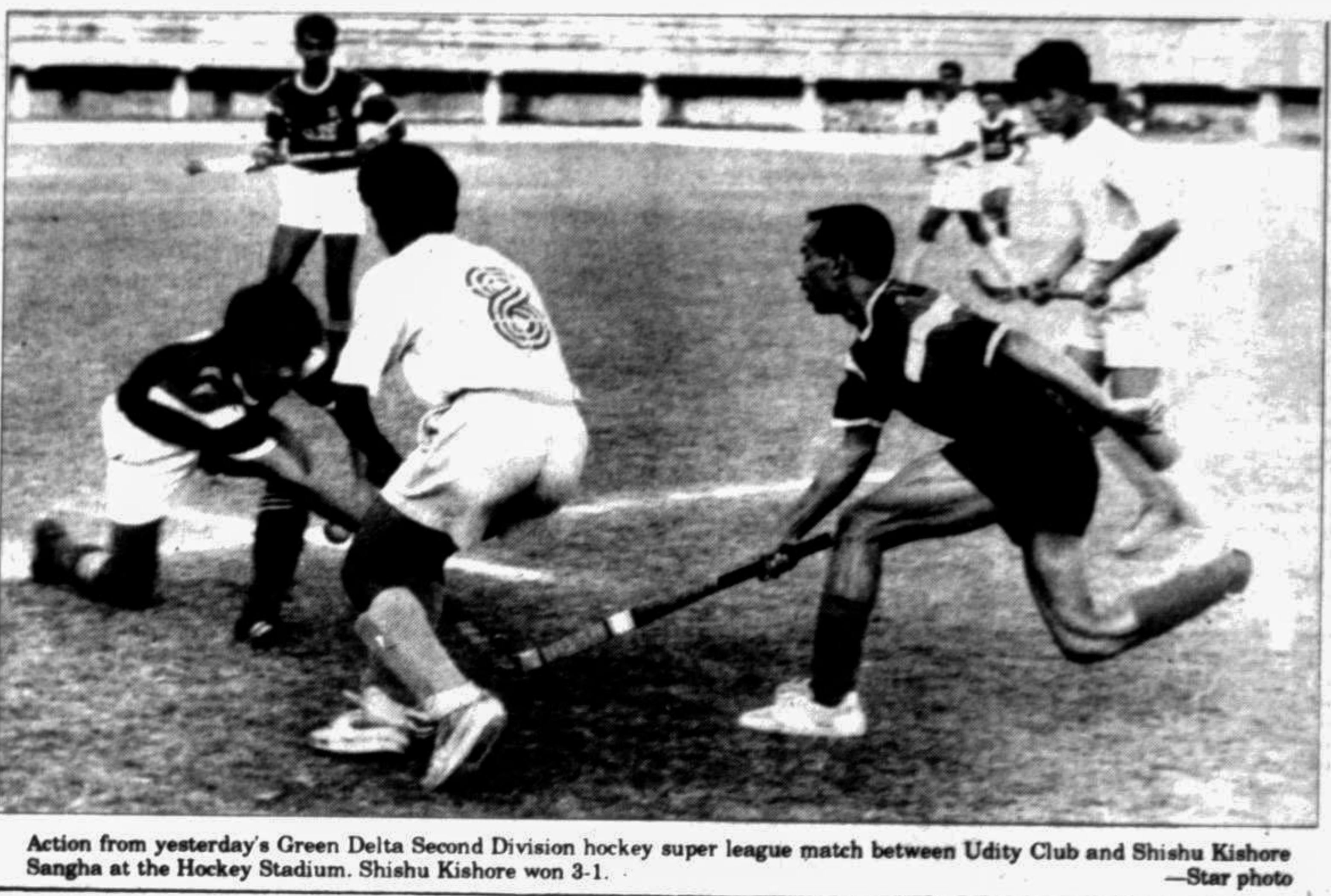
Action from yesterday's Green Delta Second Division hockey super league match between Uddy Club and Shishu Kishore Sangha at the Hockey Stadium. Shishu Kishore won 3-1.

Shishu Kishore Sangha and Cantonian SC recorded comfortable wins in their respective matches of the Green Delta Second Division hockey super league yesterday at the Hockey Stadium.