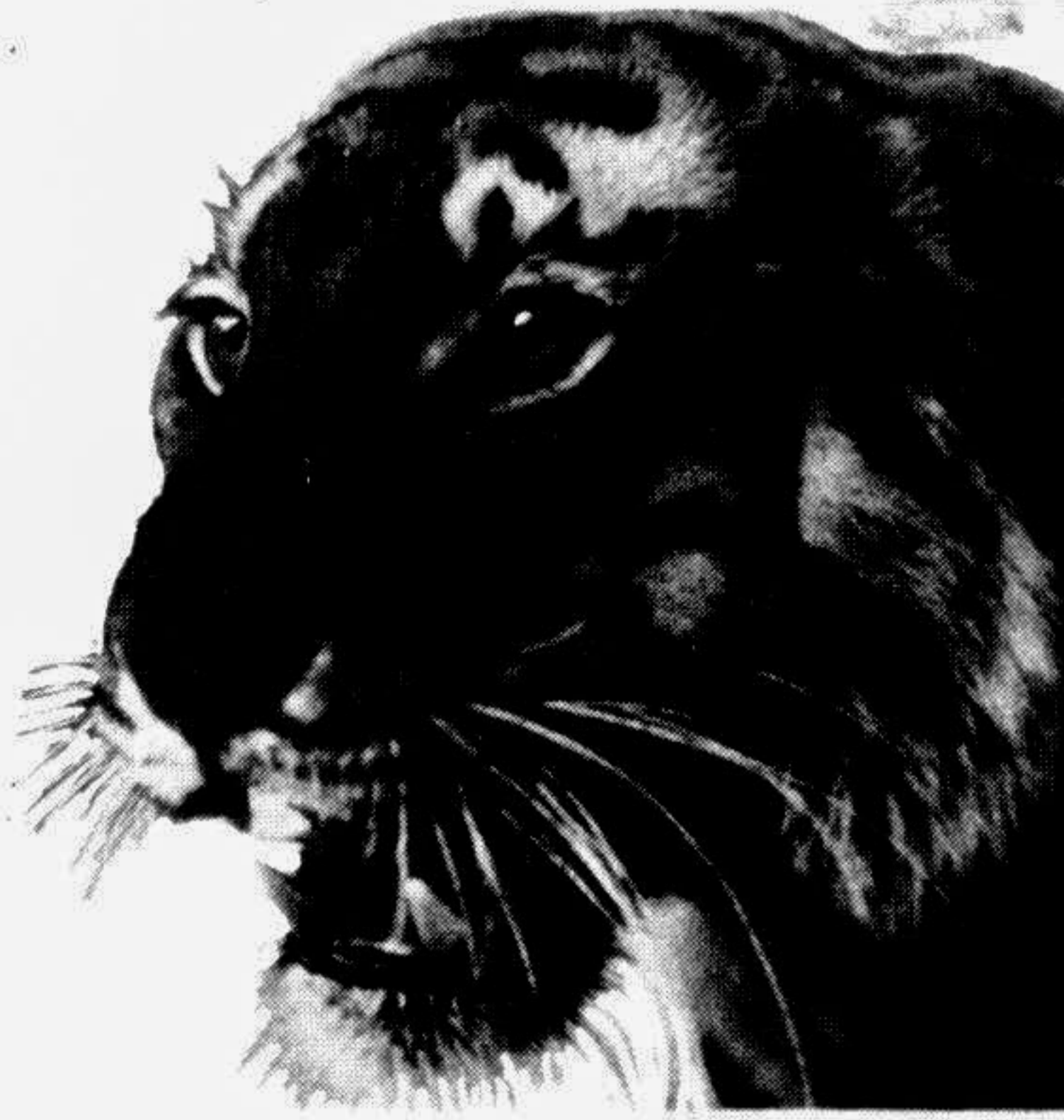
The King: No lions in the Sunderbans.

'Golpata' plays a very prominent role in rural economy. For building huts it is incomparable. Thousands of people are engaged in extracting Gol leaves, their transportation and marketing. The huts built from 'Golpata' is much more durable than those covered with grass. 'Hental' tree is used as pillars for huts, and in the man-chas. Amongst fuelwoods 'Bola' is very popular among the poorer sections because of its economic viability. 'Garan', is a high quality fuel wood. It is