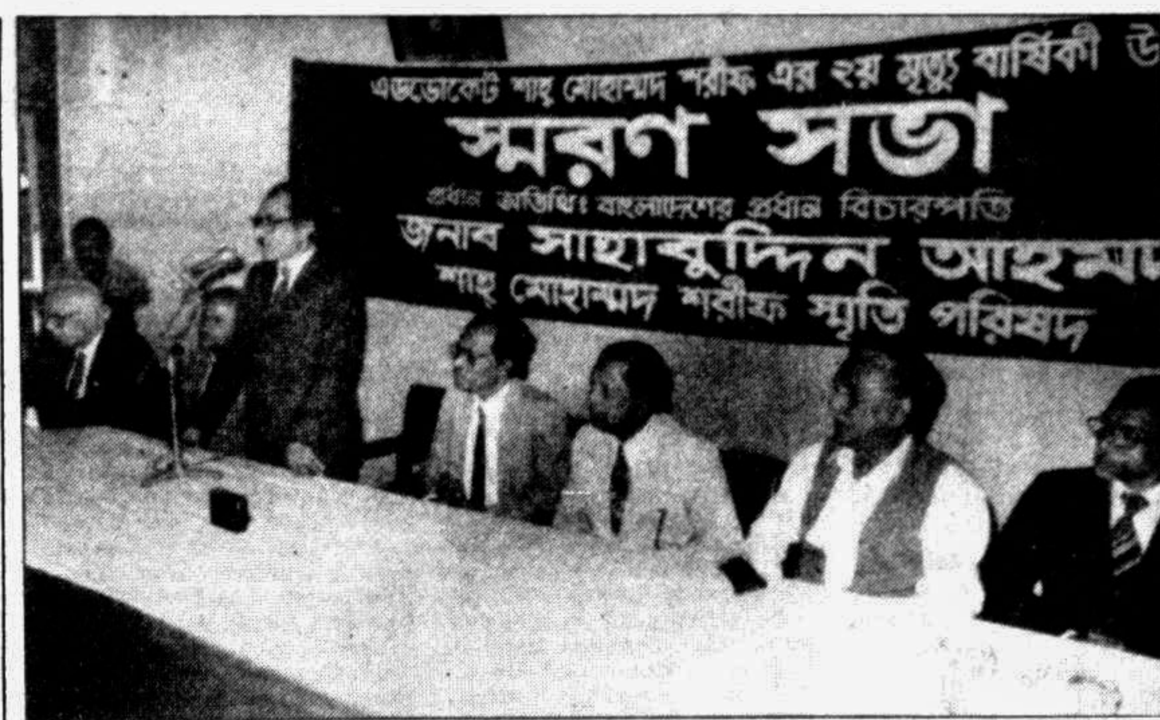
Chief Justice Shahabuddin Ahmed addressing a function organised by Shah Mohammad Sharif Smriti Parisad at the auditorium of Supreme Court Bar Association on Friday.

Sun sets today (Saturday) at 5:11 pm and rises on Sunday at 6:20 am.