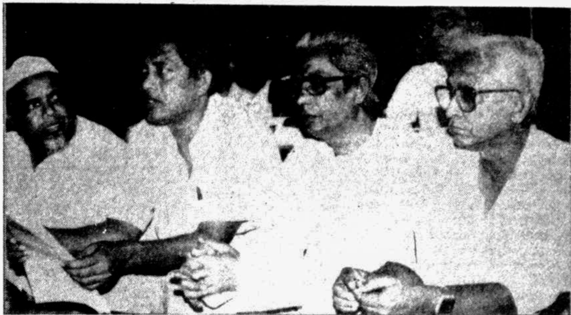
Leaders of CPB, NAP, Gano Azadi League and Samyabadi Dal announcing formation of a new political front at a joint press conference at the National Press Club Tuesday. Story on Page 1.