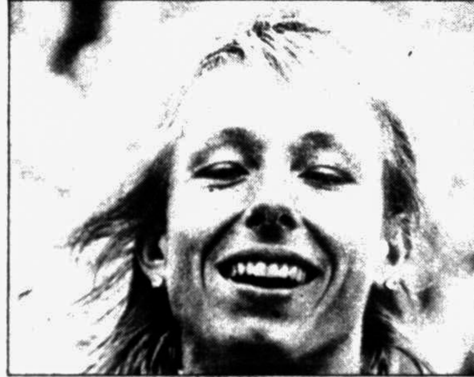
MARTINA NAVRATILOVA... chasing record

If the seedings hold, the semifinals would feature the