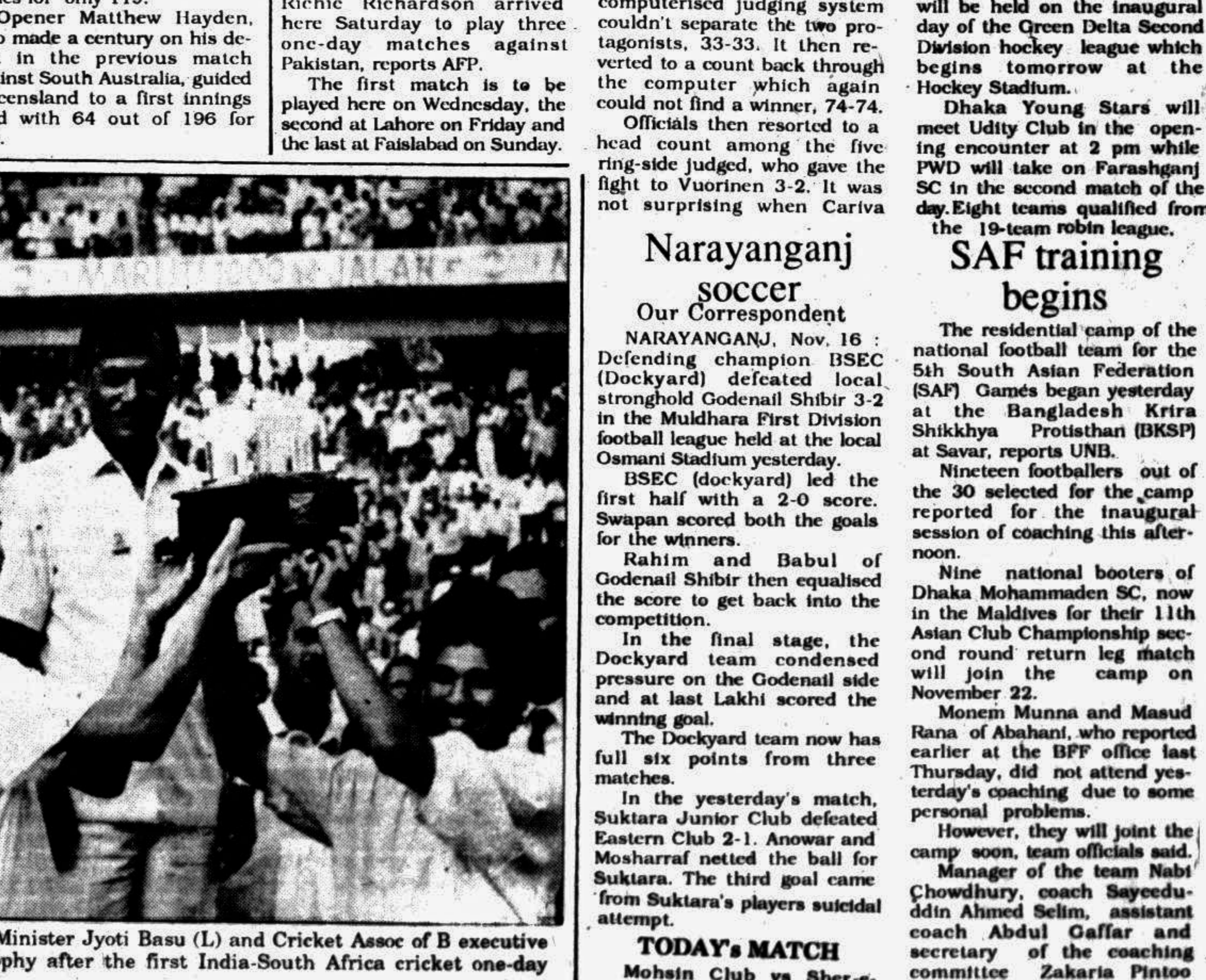
Alan Donald and Sachin Tendulkar, watched by state Chief Minister Jyoti Basu (L) and Cricket Assoc of B executive president Jagmohan Dalmiya, lift the "Men of the match" trophy after the first India-South Africa cricket one-day international at Calcutta's Eden Gardens on Nov 10.