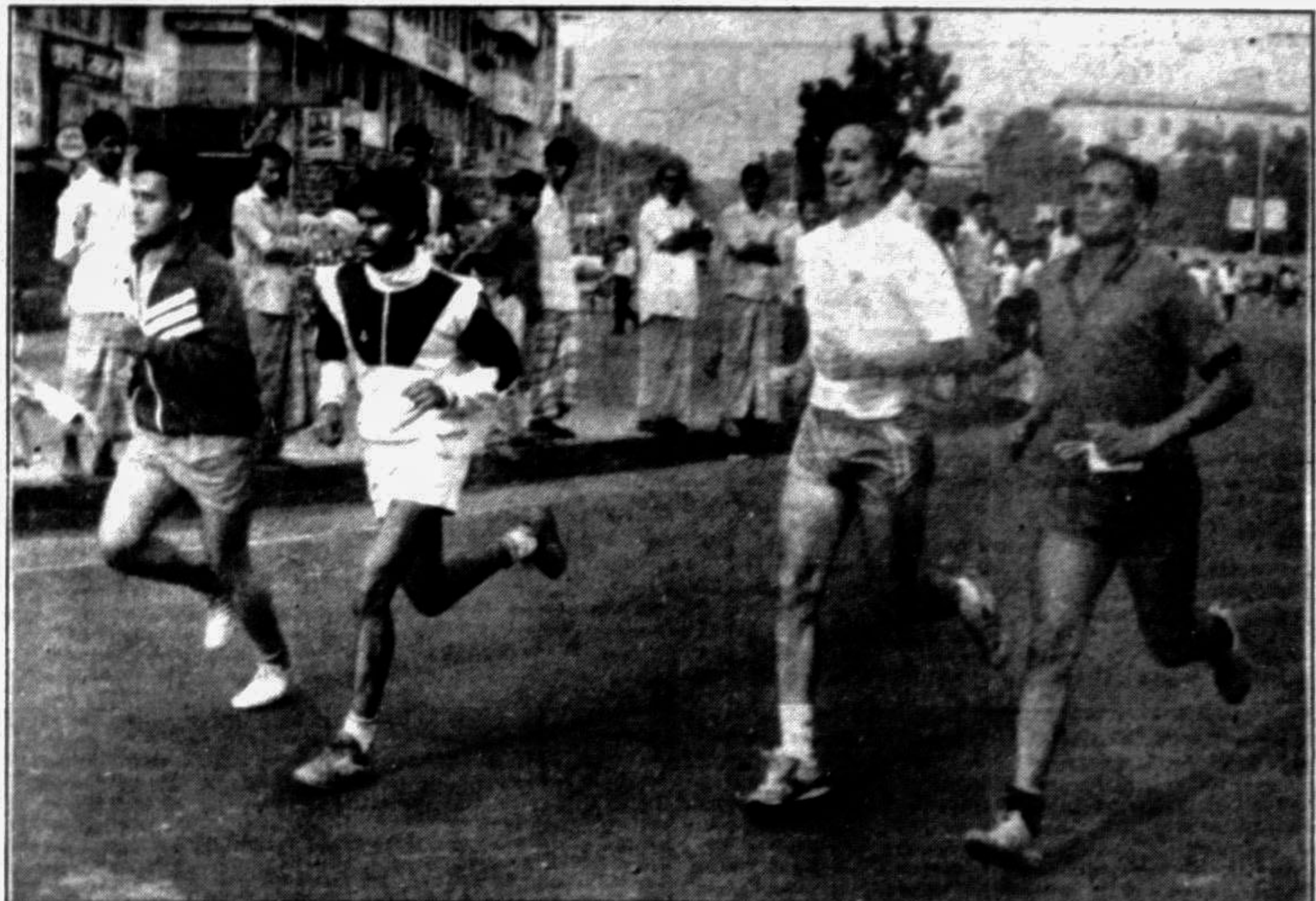
Runners in the Olympic Day Run organised by the Bangladesh Olympic Association in observance of the Olympic Day, Nov 15. Nearly 800 runners including over 400 sports people took part in the race which set off at 6:30 am yesterday from the Banani Army Stadium and concluded at the Dhaka Stadium.