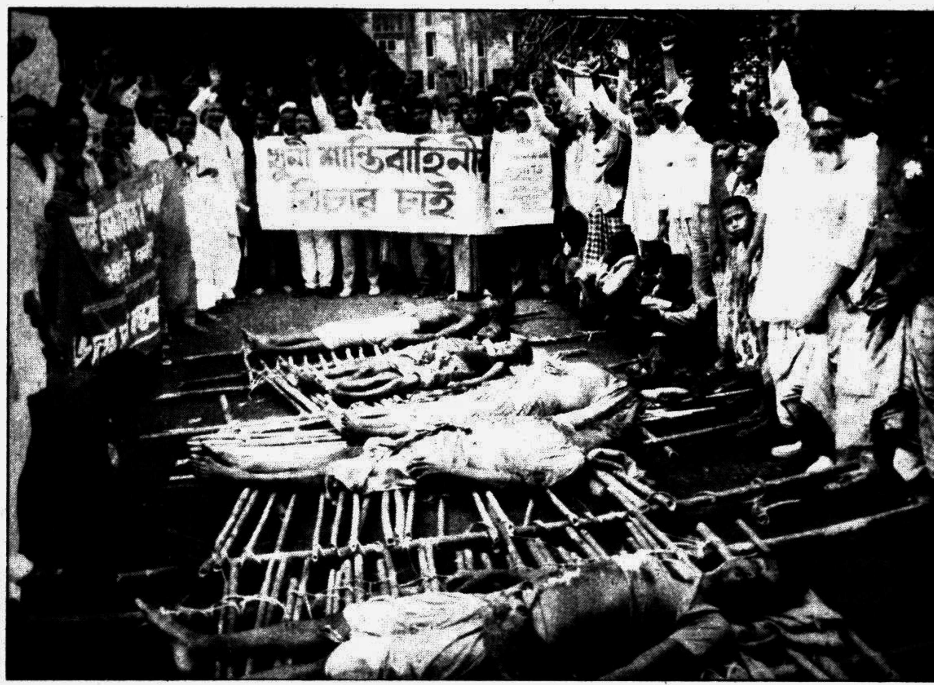
Mourners from hilly Khagrachhari district demonstrating with six bodies in front of the National Press Club on Friday.