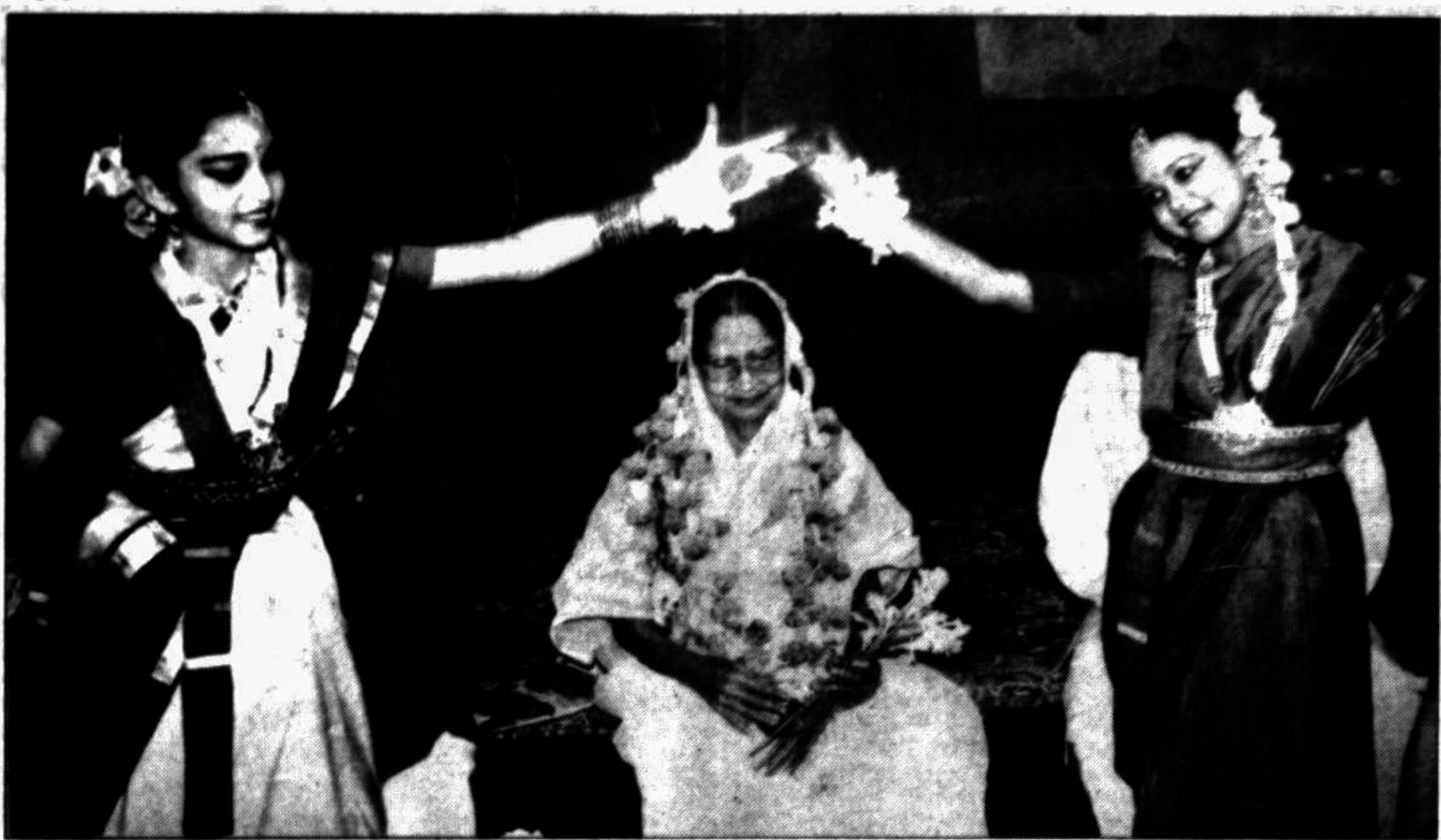
A civic reception was accorded to poet Sofia Kamal Thursday on the occasion of her 80th birthday anniversary at Shilpakala Academy in the city.

Tk 10cr project for cyclone-hit areas CHITTAGONG, Nov 14 : Local Engineering Bureau of the Local Government, Rural Development and Cooperatives has undertaken a cyclone rehabilitation project at a cost of Taka 10 crore for the Chittagong district during the current fiscal year, reports BSS. According to an official source, the project includes, reconstruction of culverts, bridges and feeder roads damaged during the devastating cyclone and tidal surge of April 29. There are 47 schemes under the projects. The project to be financed by Asian Development Bank and Bangladesh government would be completed by June 1993. Meanwhile, the Engineering Bureau has already completed 75 per cent reconstruction works of the flood rehabilitation project which it started in 1989 at a cost of Taka 4.50 crore. The number of schemes under the project is 44 which is expected to be completed by June 1992. The Asian Development Bank is also financing the project.