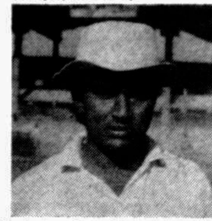
Portrait of a player.

The South Africans brought in Mandy Yachad, Craig Matthews and Clive Eksteen, in place of Andrew Hudson, Tim Saw and Brian McMillan who played Sunday.