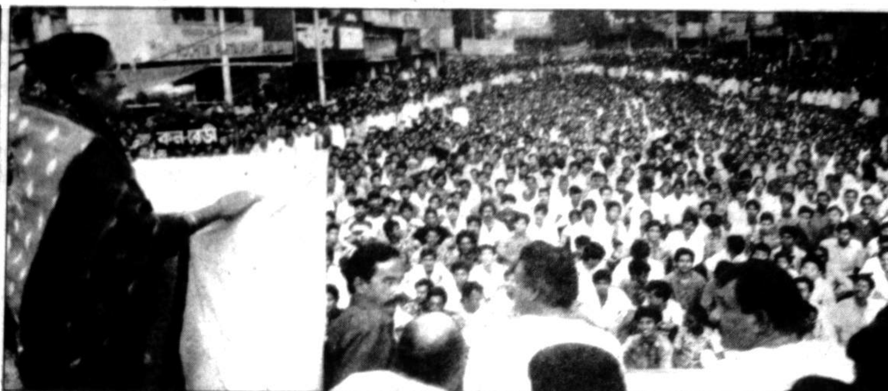
The Awami League chief and Leader of the Opposition in parliament Sheikh Hasina addressing a rally of Jubo League in city on Saturday. Story on Page 1.