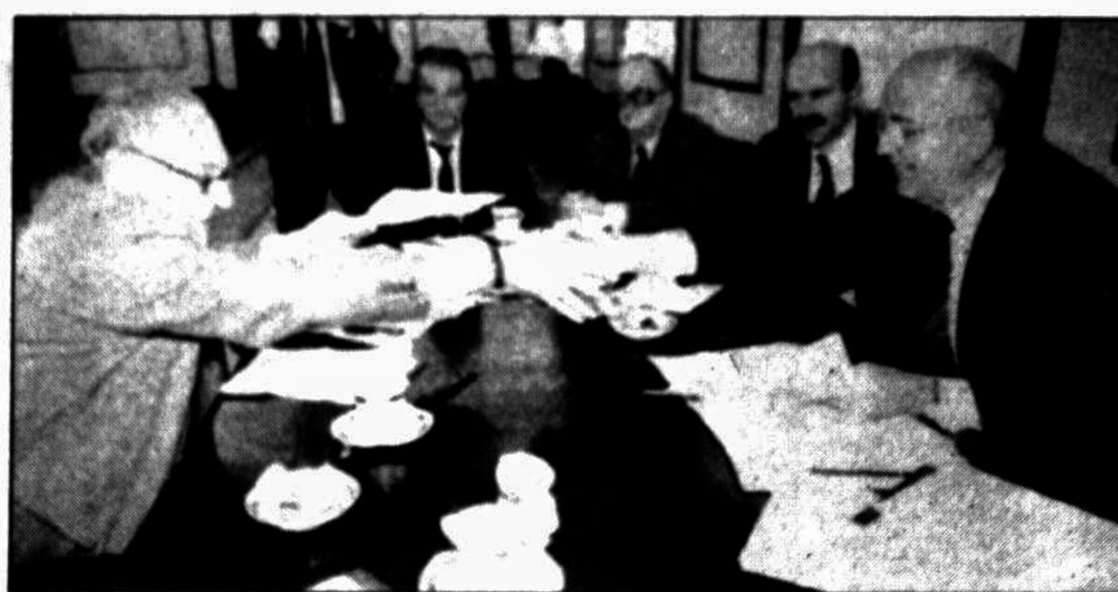
Lewis T Preston, President of the World Bank shakes hands with Soviet President Mikhail Gorbachev after signing a technical cooperation agreement in Moscow on Tuesday.

When police resorted to lathicharge the clashes spread to neighbouring areas.