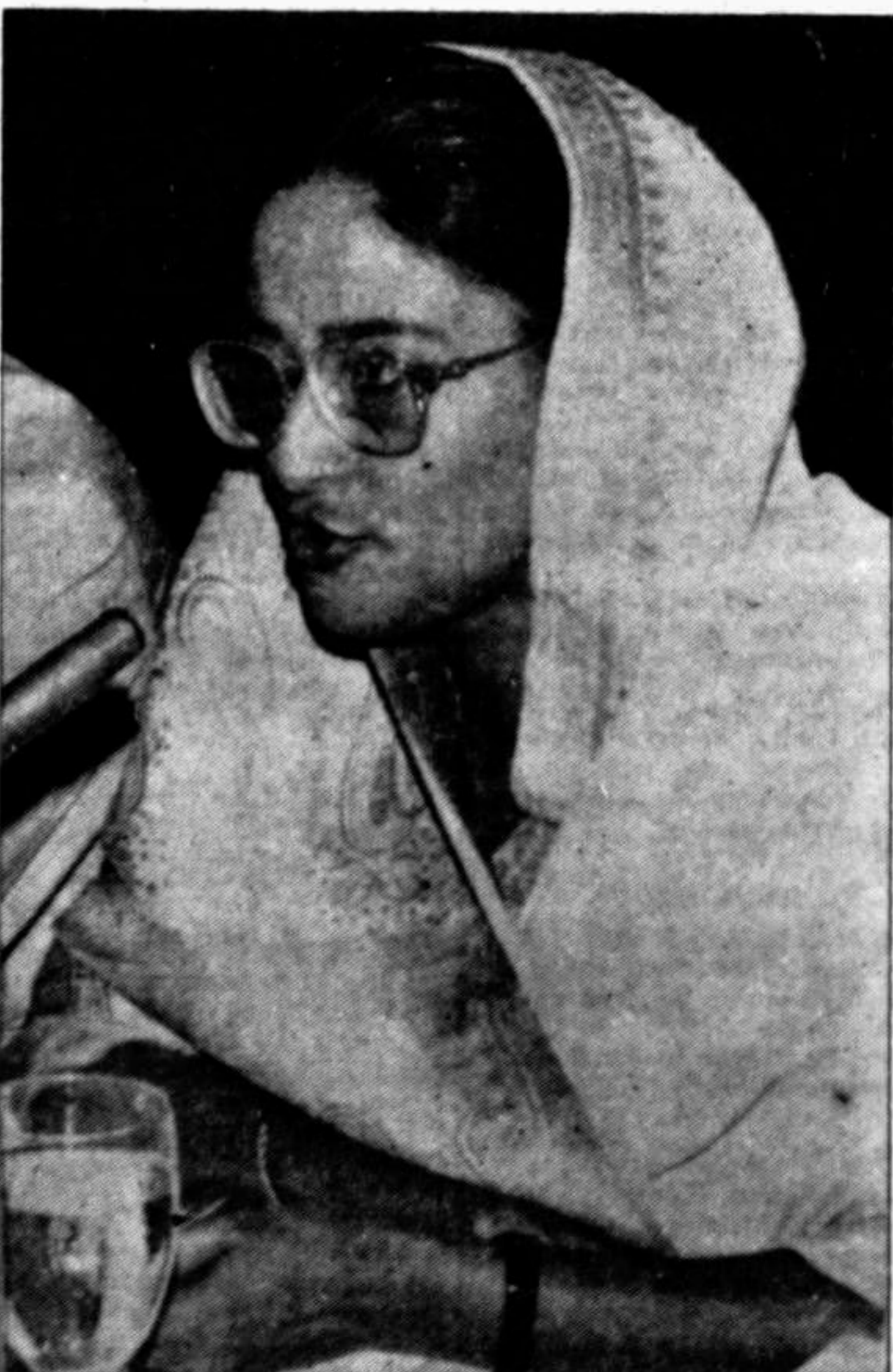
Opposition Leader of the House AL chief Sheikh Hasina talking to editors at a local hotel Thursday.