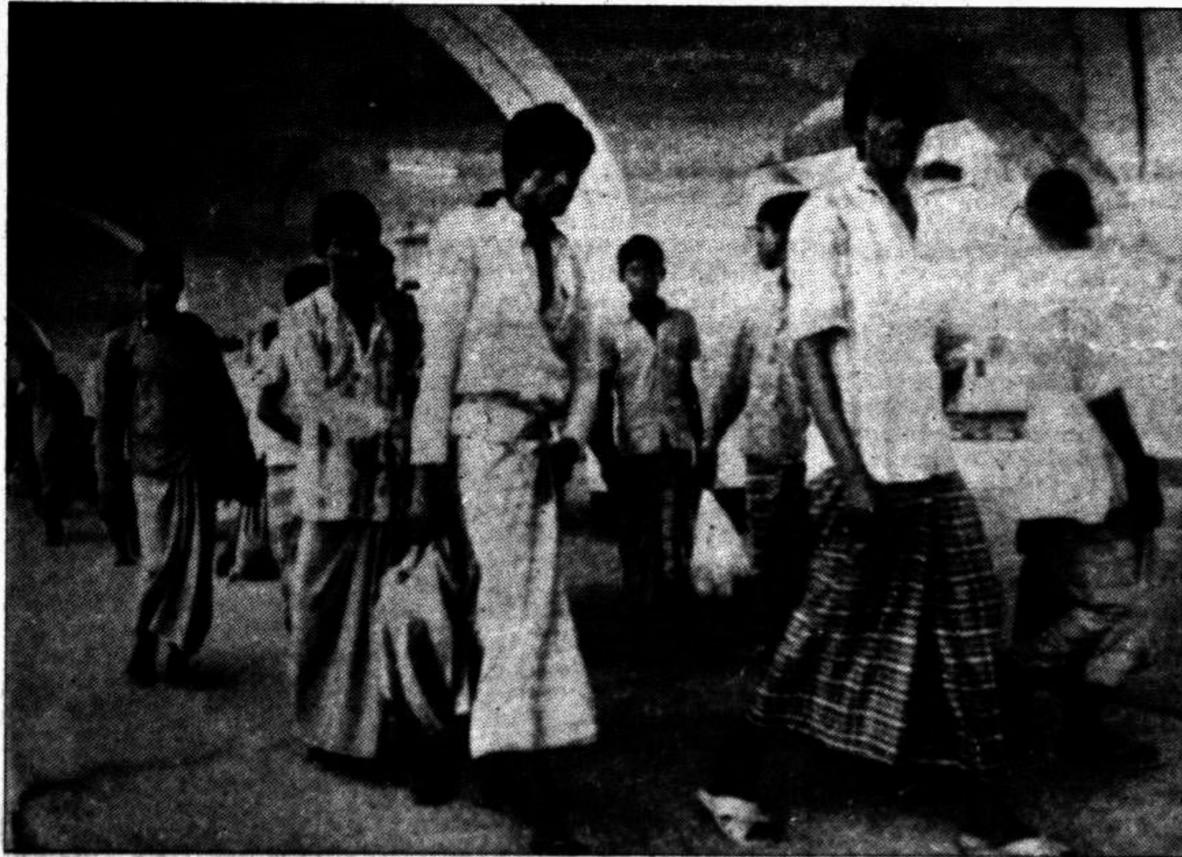
SOUND OF FOOT STEPS NEARING: People from flood-hit areas of the northern districts flow into the city for jobs and food.