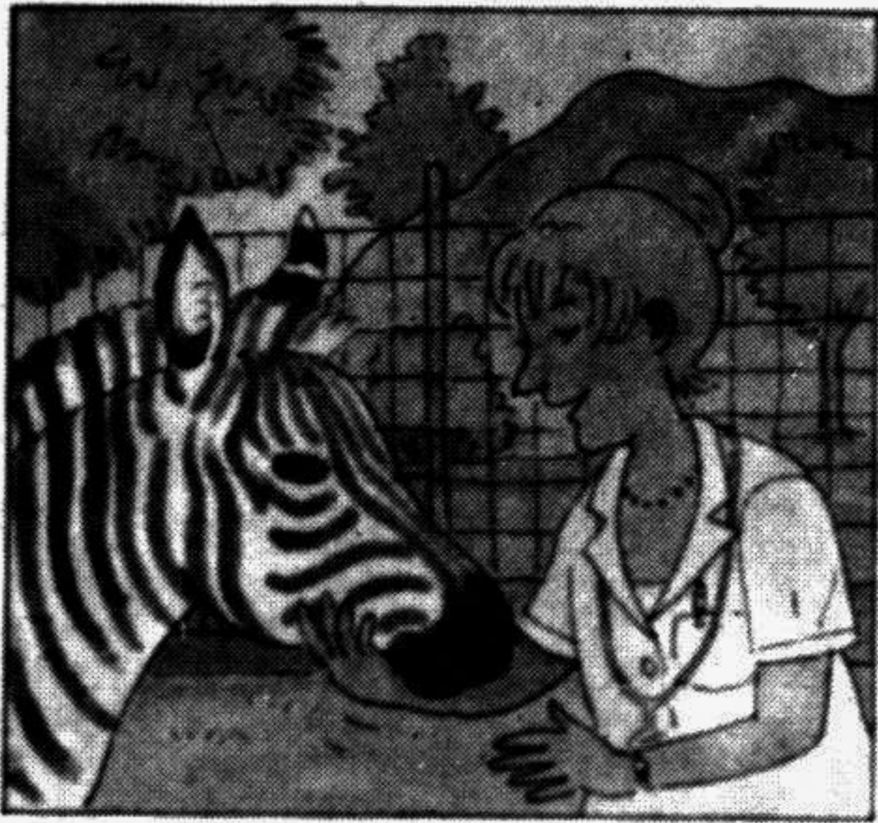
An illustration from 'Astrapi'.

"Astrapi" costs 25 francs and has a circulation of a hundred thousand. It employs 13 regular workers and various part-timers. Its news sheet, included in the magazine, is very innovative.