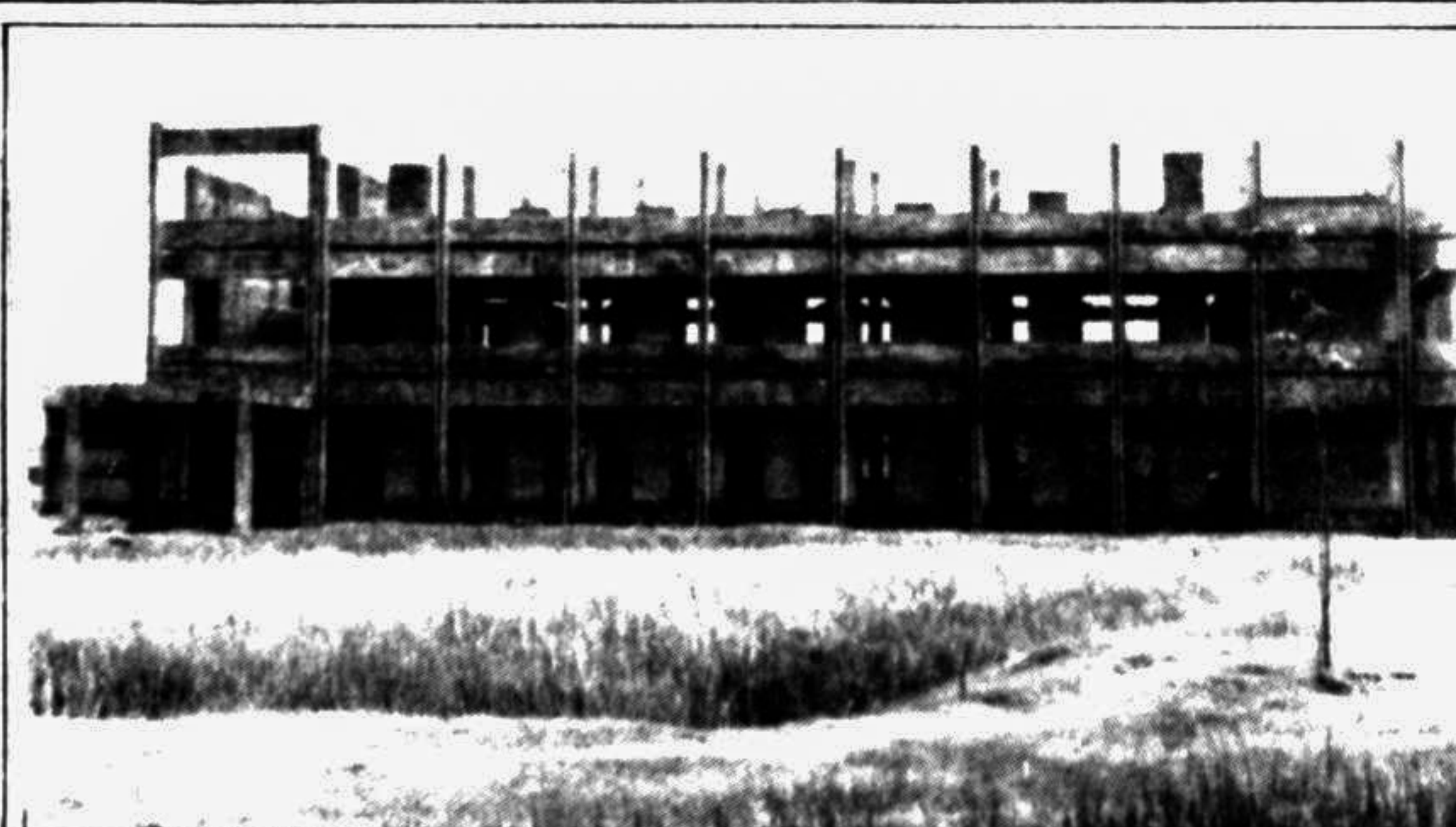
KISHOREGANJ : Construction work of the office of Kishoreganj district police line and SP office is yet to be completed due to fund constraints hampering over all work of the department.

According to a report one Jobber sold a plot of land to Tofazzal of the same village. Later Mofizul purchased the same plot. But the sale deed indicated the plot as home-estead. On the fateful day when Mofizul went to take possession of land he was resisted by the rival supporters and a clash ensued between the two groups. In which three persons received injuries. Meanwhile, rival supporters arsoned five dwelling houses. Fire brigade rushed to the spot and brought the fire under control. Two cases were filed with Gaibandha thana.