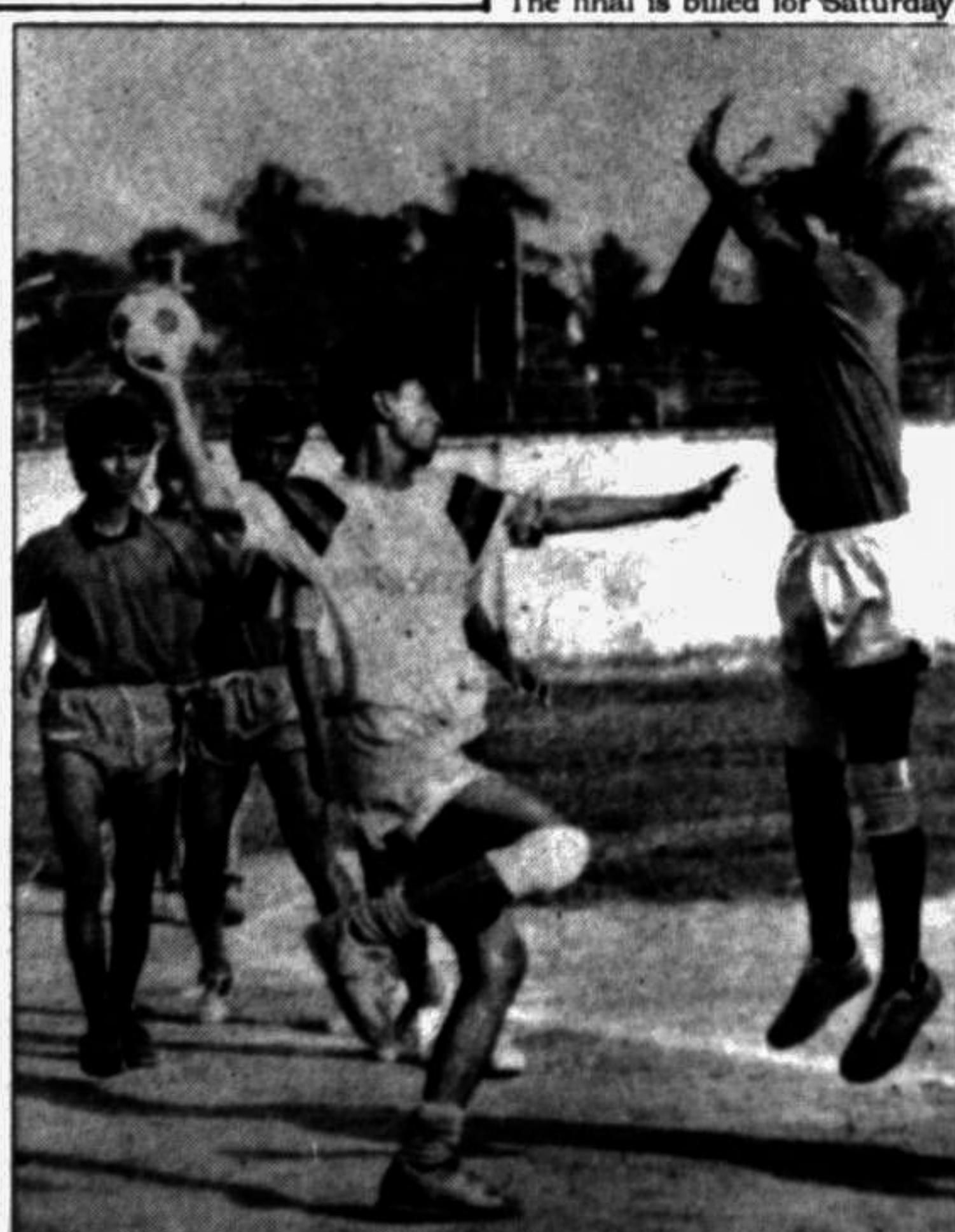
Action from yesterday's 4th Bata schools handball match at the Outer Stadium between Bawnia Abdul Jalil High School and Bhashantek High School. Bawnia won 14-10.

FILDERSTADT, Germany, Oct 21: Sixteen year-old Anke Huber prevented Martina Navratilova equalling Chris Evert's record of 157 tournaments when she beat the American in the Grand Prix final here yesterday, reports AFP. "It was my greatest ever win," Huber said after bouncing back from a set down to win 2-6, 6-2, 7-6. The world number 21 took the tie-break 7-4 for her first major tournament. Navratilova, ranked fourth in the world, had won this event five times and had been hoping to celebrate her 35th birthday last Friday with a party. It was the second time in as many weeks Navratilova had failed at the final hurdle in her attempt on Evert's record. She lost to Yugoslavia's Monica Seles in the Milan final last week.