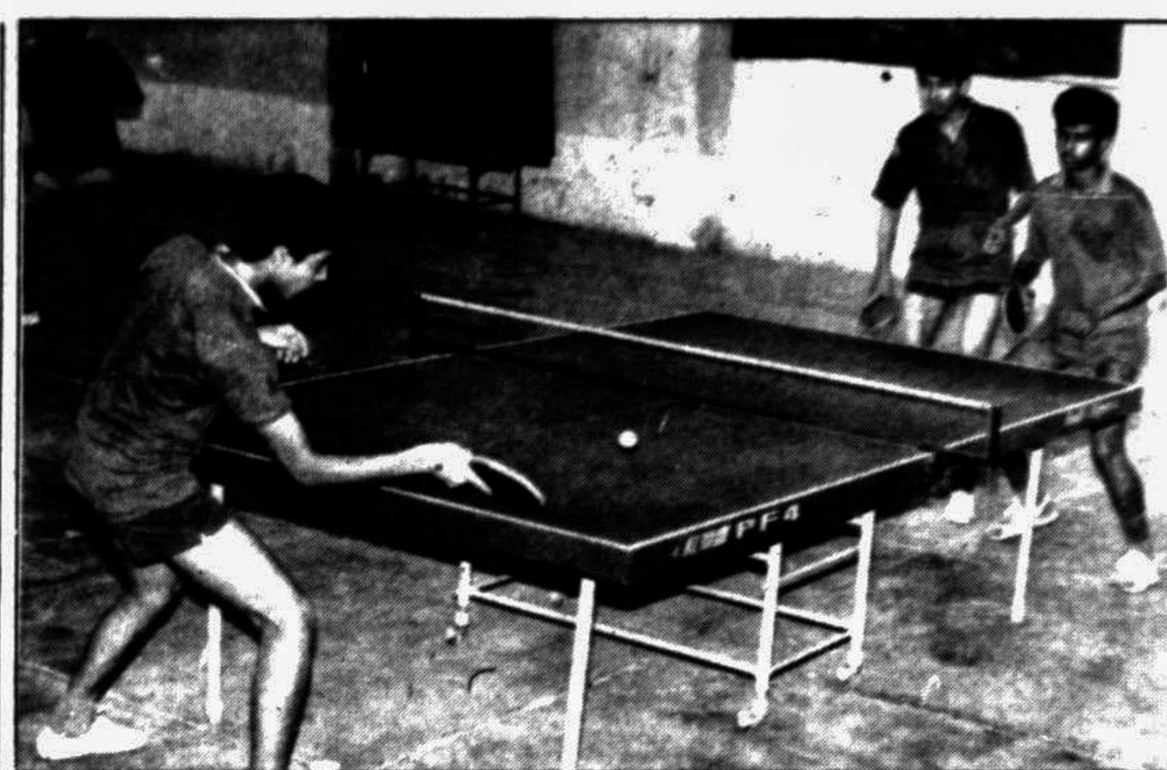
Scene from yesterday's AB Bank metropolis table tennis league match between Armanitola Juniors and Victoria Sporting Club. Armanitola Juniors won by 3-1 sets.

Result: Pakistan won by one run. Bowling: Ambrose 10 0 53 4, Bishop 10 1 44 1, Walsh 10 0 48 0, Patterson 10 1 53 0, Hooper 10 0 30 1.