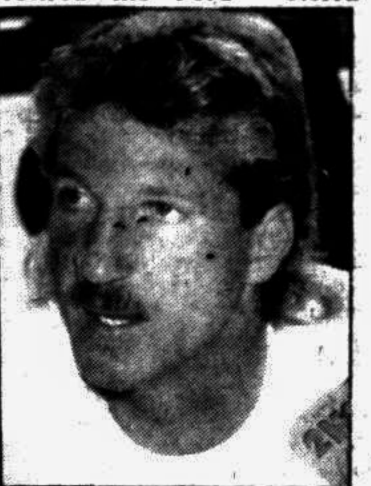
IAN BOTHAM Cosworth with mechanical problems. Persistent misfiring during the official qualifying left him at the back of the 31 car grid for the start.

LONDON, Oct 21: England cricketer Ian Botham's motor racing debut came to an end on the opening lap at the Donington Park circuit on Sunday, reports AFP. Botham finished the first lap of the saloon Car Championship race but then retired his Ford Sierra