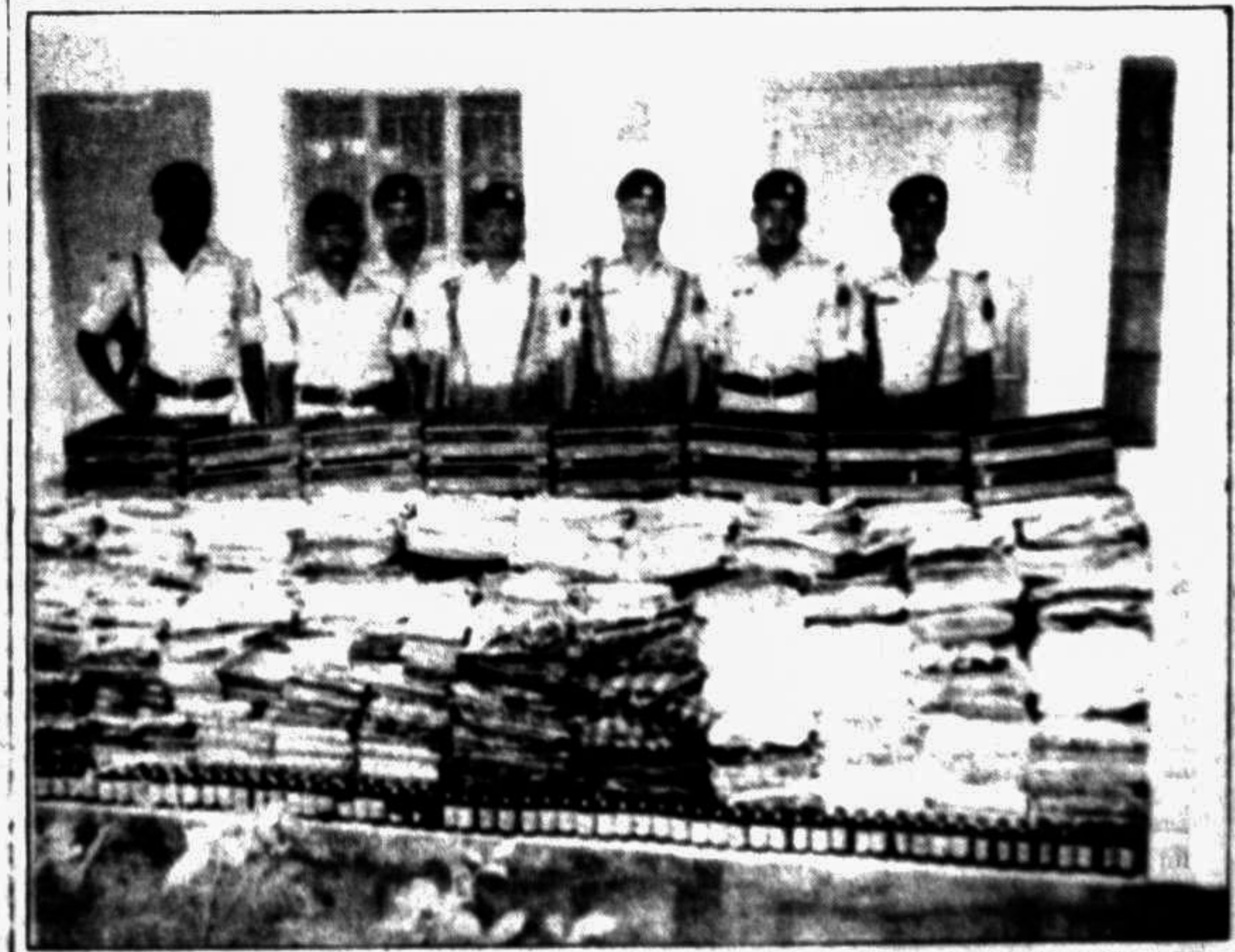
JHENIDAH: Contraband goods worth Tk 30 lakh seized from different places of Jhenidah and Jessore.

The shortage of teaching staff has aggravated the situation further. A total of 164 posts of primary school teachers have been lying vacant for a long time in these districts, it is learnt.