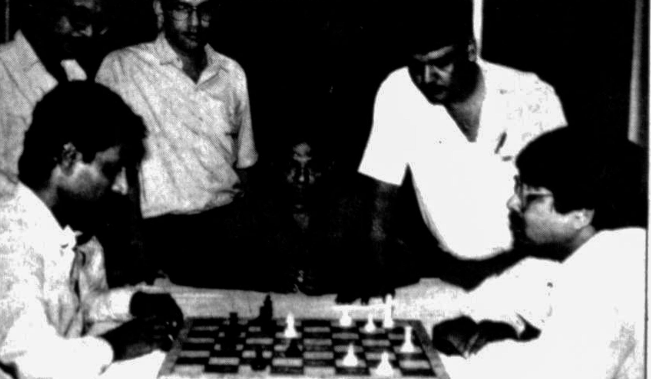
A chess competition began yesterday at the Jatiya Press Club as part of the club's 37th founding anniversary on Oct 19.