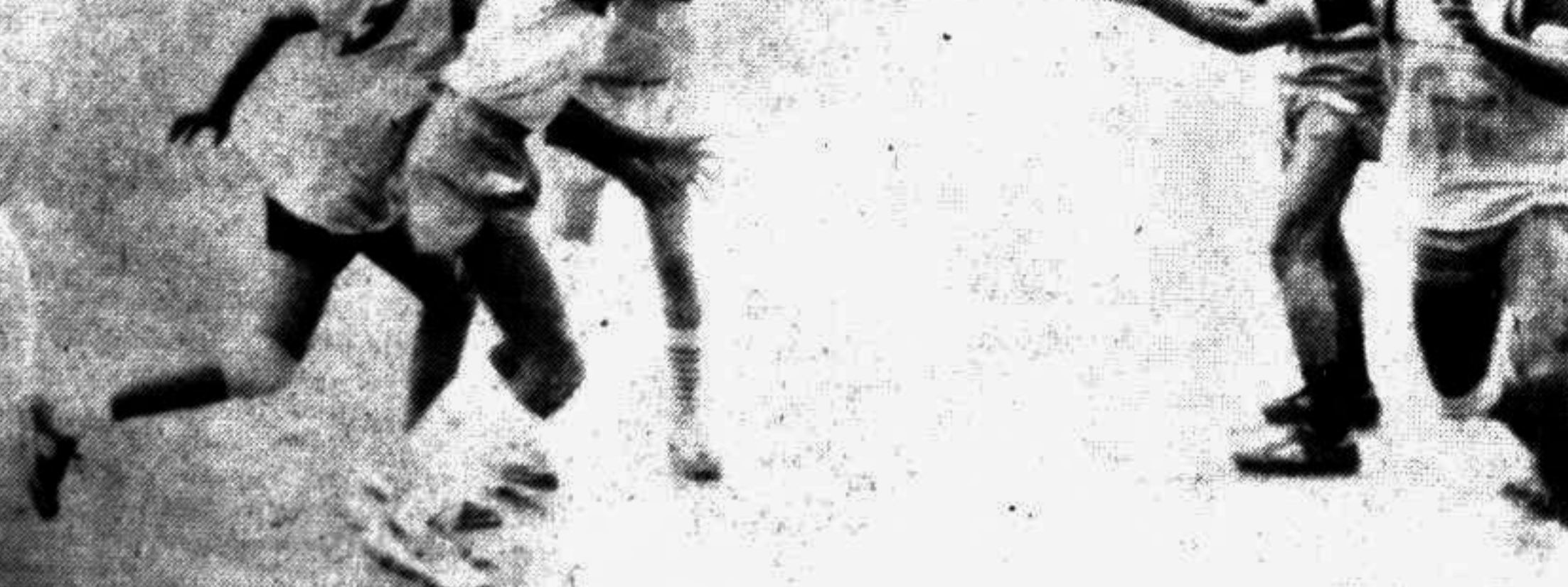
Action from yesterday's Bata schools handball match between Ansar and VDP High School at Outer Stadium handball court. Ansar and VDP School won 22-15.

their independence, the IOC is unlikely to admit the 12 remaining Soviet republics as separate teams to next year's Games.