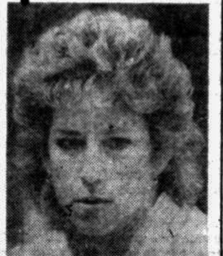
CHRIS EVERT, 38, a former Olympic skier. The couple have been married three years.