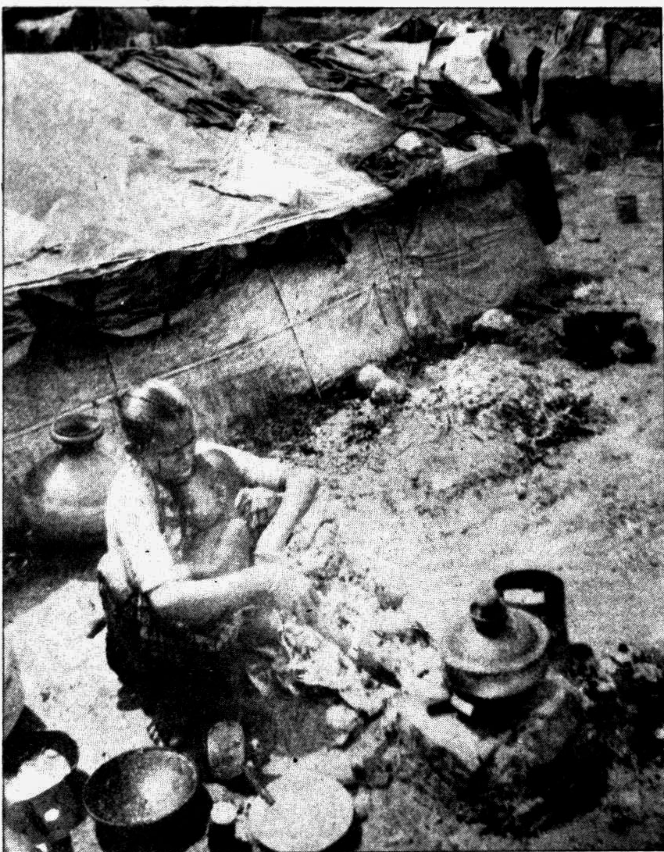
The number of homeless people is increasing day by day. These uprooted people are crowding urban areas for their sustenance but passing agonising days in makeshift slums. Photo shows a woman with her kid in the lap cooking in the open in an unhygienic way endangering the health of her child in Narayanganj.