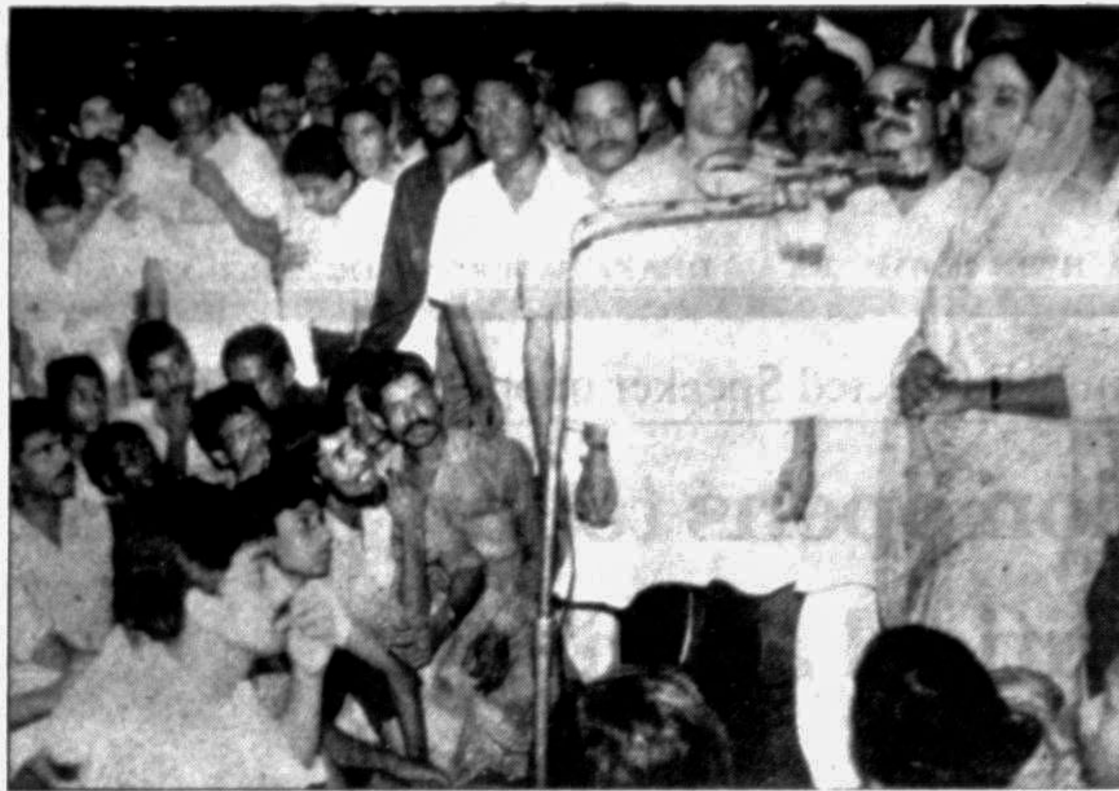
Awami League Chief and Leader of the Opposition in Parliament Sheikh Hasina addressing a group of BNP workers from Jatrabari area who joined the party, at her Dhanmondi residence on Friday.

The NBA session started with Asaduzzaman Noor reciting from Shamsur Rahman's poem on Dhaka City. It was followed by a musical soiree.