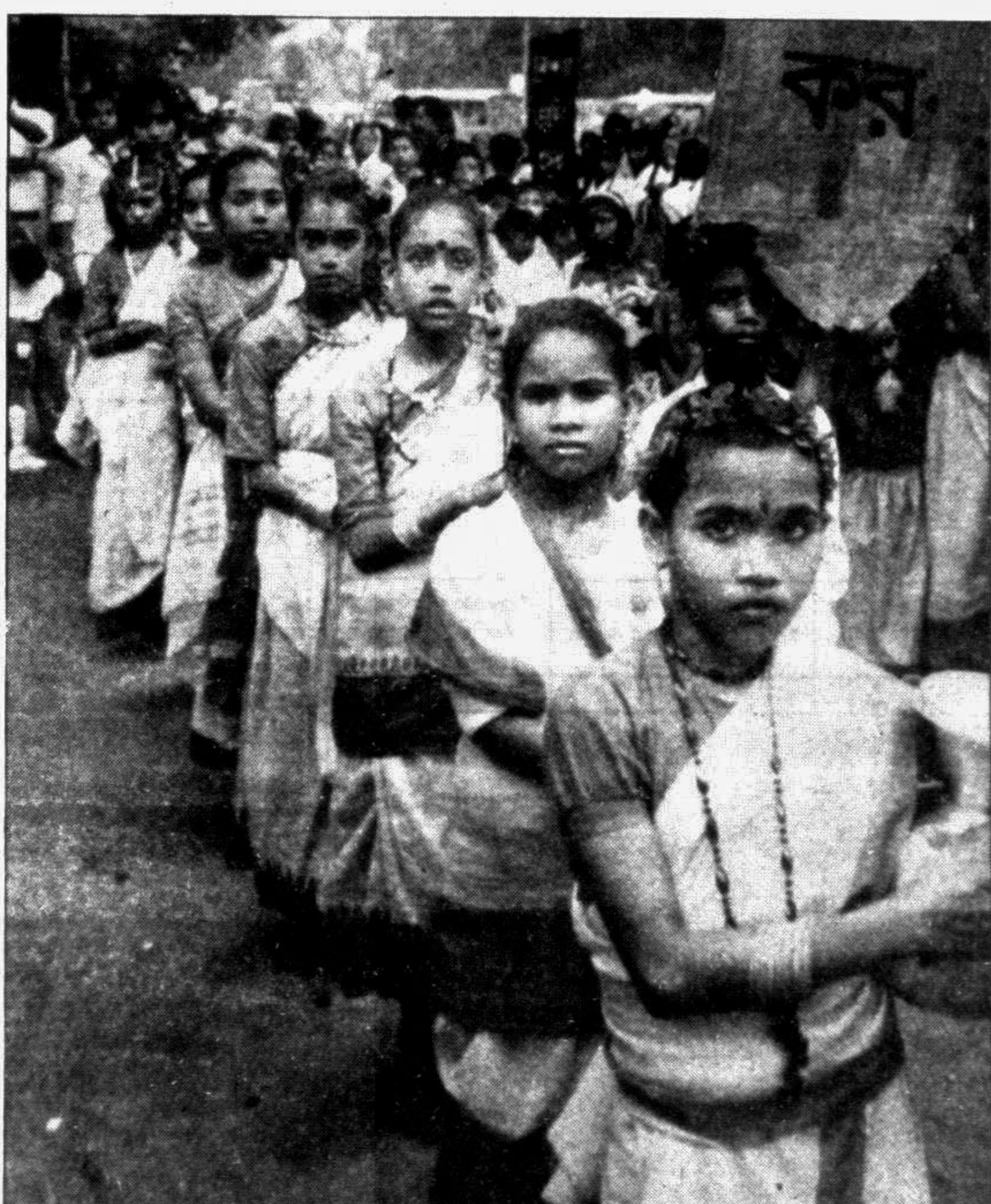
'Stop children trafficking'... children with the slogan came out in a procession on the city streets yesterday on the occasion of Children's Day.

Star Report The session is likely to be stormy, because big opposition parties, Awami League and Jatiya Party, are having a strained relationship with the ruling Bangladesh Nationalist Party (BNP). The Awami League will take up the issue of passage of the Indemnity Repeal Bill submitted by Mohammad Nasim, Chief Whip of the Opposition and launch a frontal attack on the treasury bench for its alleged reluctance to institute an inquiry into a reported conspiracy to assassinate Sheikh Hasina and its failure to check campus violence. The Jatiya Party will try to mount pressure for the release of deposed president H M Ershad convicted in an arms case. As regards the election of the Deputy Speaker, the government and the opposition parties are yet to come to terms. It is gathered that the largest opposition party in parliament, Awami League, will not field any candidate against Sheikh Razzak Ali if the latter contests for the post of Speaker. However, AL may not allow the election of the Deputy Speaker to go unchallenged, if the move to have a consensus candidate fails. In that case, AL's possible nominees are Sudhansu Shekhar Haldar or Col (ret'd) Shaukat Ali, according to reliable sources. The probable candidates of the BNP for the post of Deputy