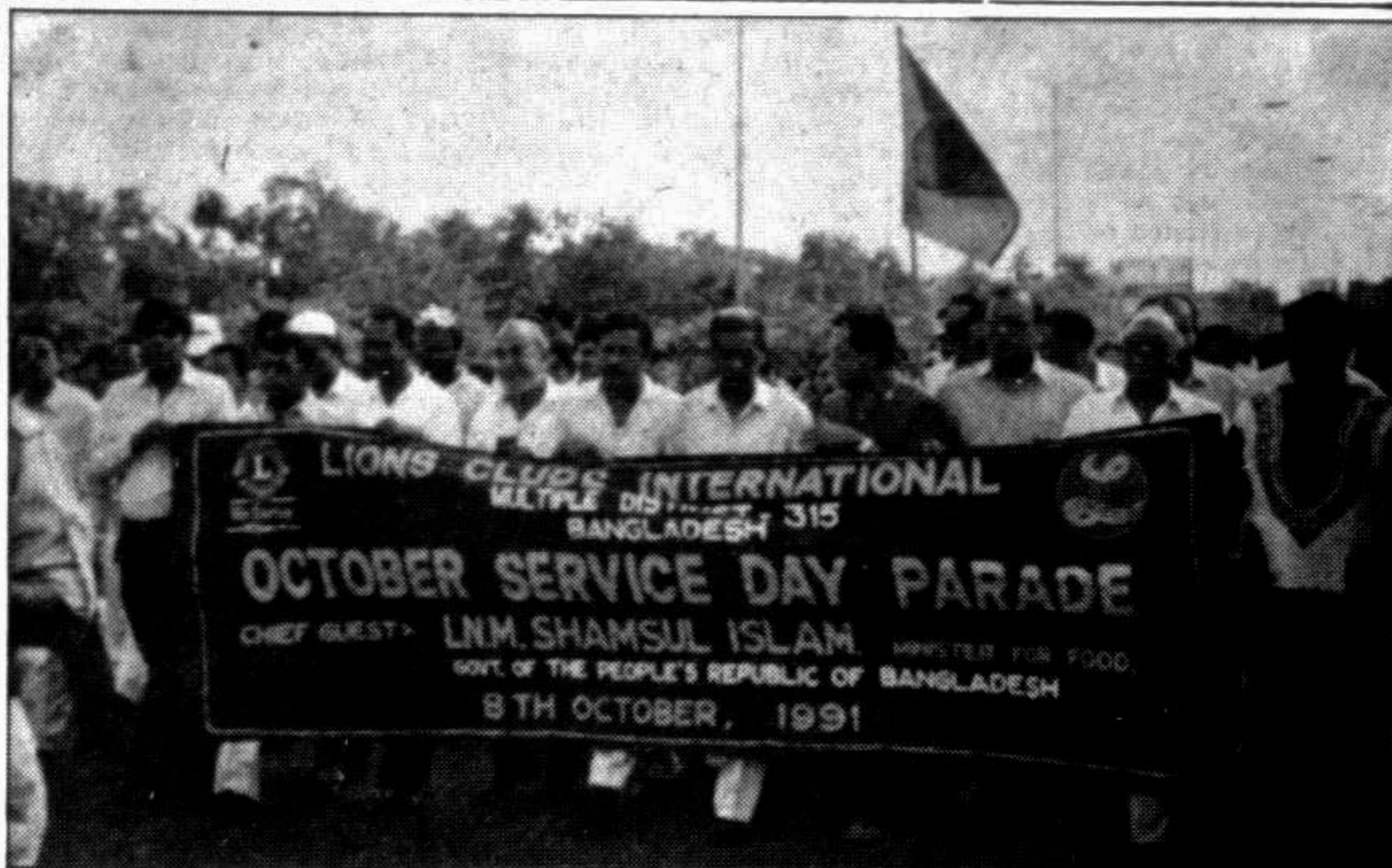
Lions Club International Multiple District 315 Bangladesh organised October Service Day parade in city on Tuesday.