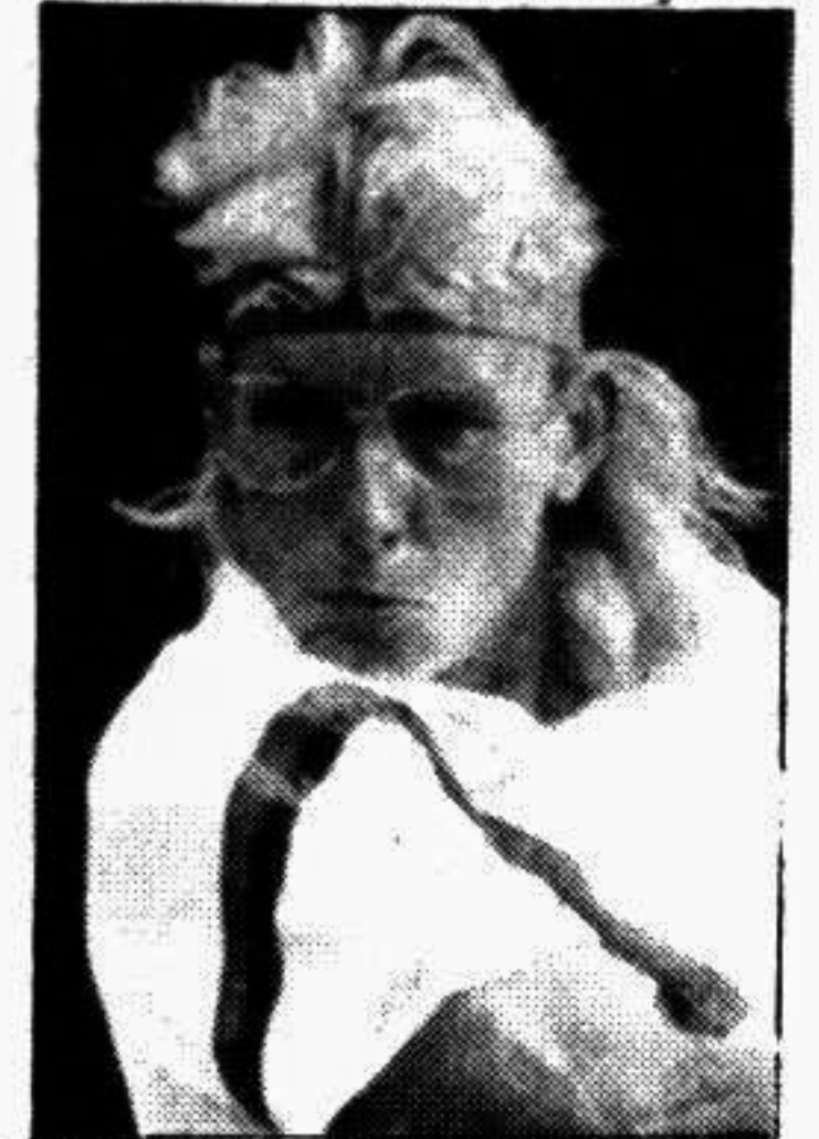
MARTINA NAVRATILOVA in the 1985 Wimbledon tournament.

Navratilova can equal a record of 157 tournament wins, also held by Evert, if she reaches and wins Sunday's fi-