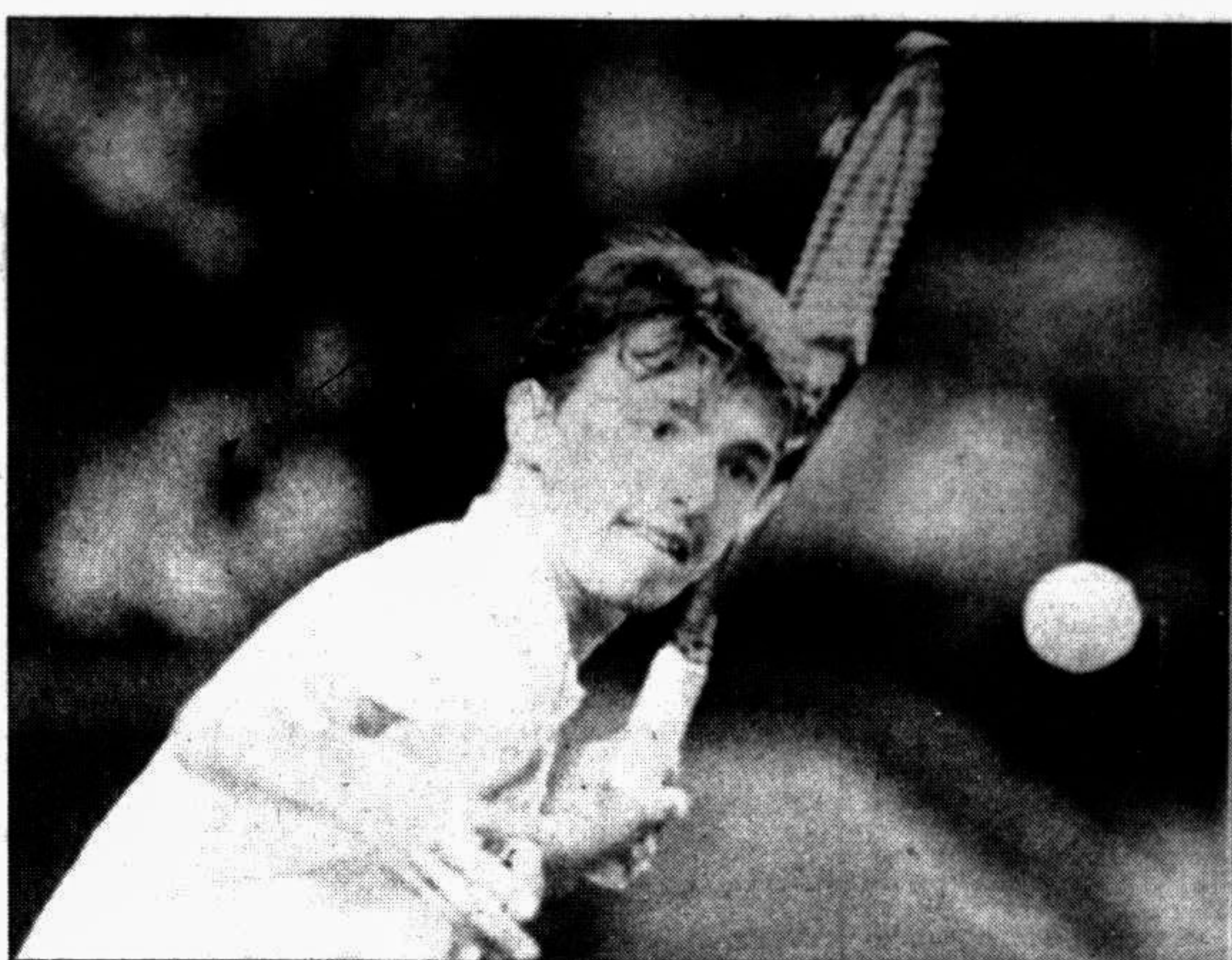
Goran Ivanisevic — the Yugoslav who has recently pledged his allegiance to the break away Republic of Croatia — returns the ball to American Andre Agassi during the first quarter final of the Australian indoor tennis championships in Sydney on Oct 4. Ivanisevic won the match in tie-break but was eventually disposed of by world No 1 Stefan Edberg in yesterday's semifinal.