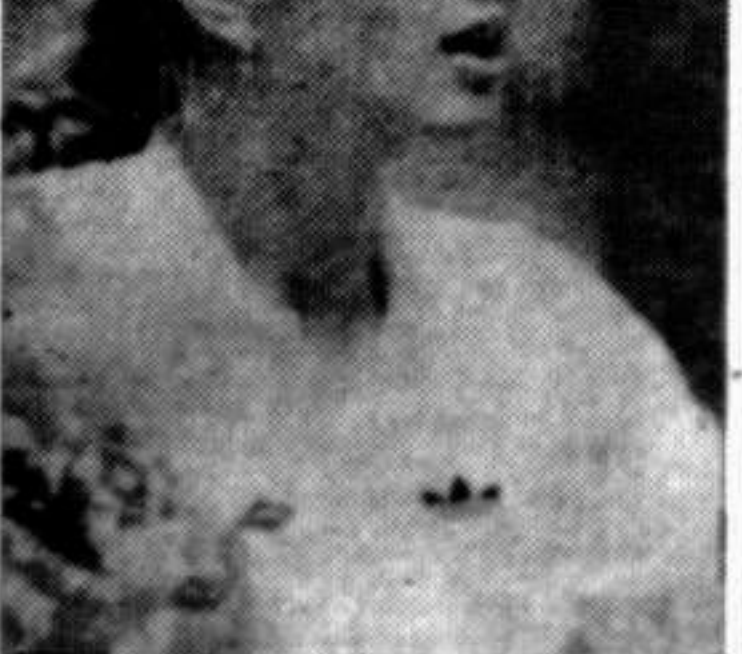
STEFFI GRAF with a shoulder injury, flew back to Leipzig on Friday after a 12-hour visit to Heidelberg for treatment.

The German world number two, who has recently returned from a four-week layoff