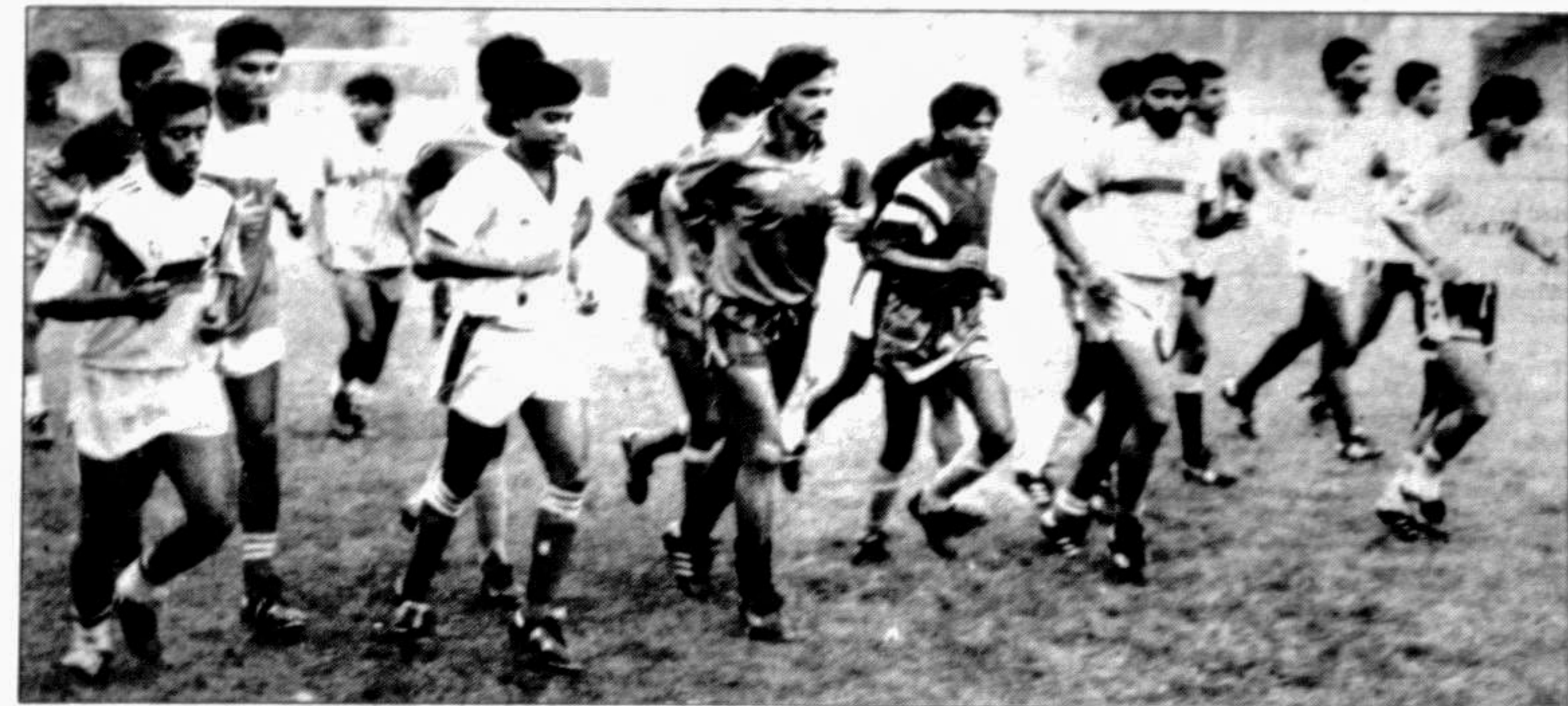
Defending Federation Cup champions Mohammedan Sporting Club take the field in this year's tournament tomorrow against Fakirerpool in the robin league at the Dhaka Stadium. Our picture shows the champions going through the paces during a regular practice session at the Dhaka University ground.