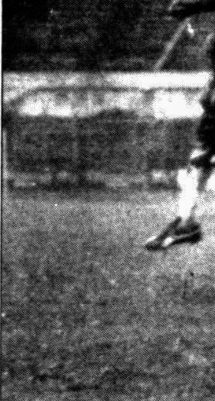
Action from the first of yesterday's Fed Cup first round matches between Fakirerpool YMC and Victoria SC at the Dhaka Stadium. Fakirerpool won 3-1 to move into the second round.

Victoria pressed hard for the equaliser, leaving yawning