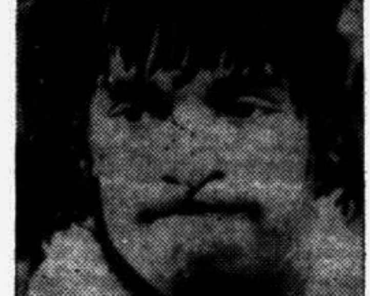
YANNICK NOAH ties, like speed and stamina for example. "But I have a month before I need to decide whether I can

5-7, 7-5, 6-3 defeat. "From a technical point of view, I was felling the ball well," he said. "I just had some physical difficulties, like speed and stamina for example."