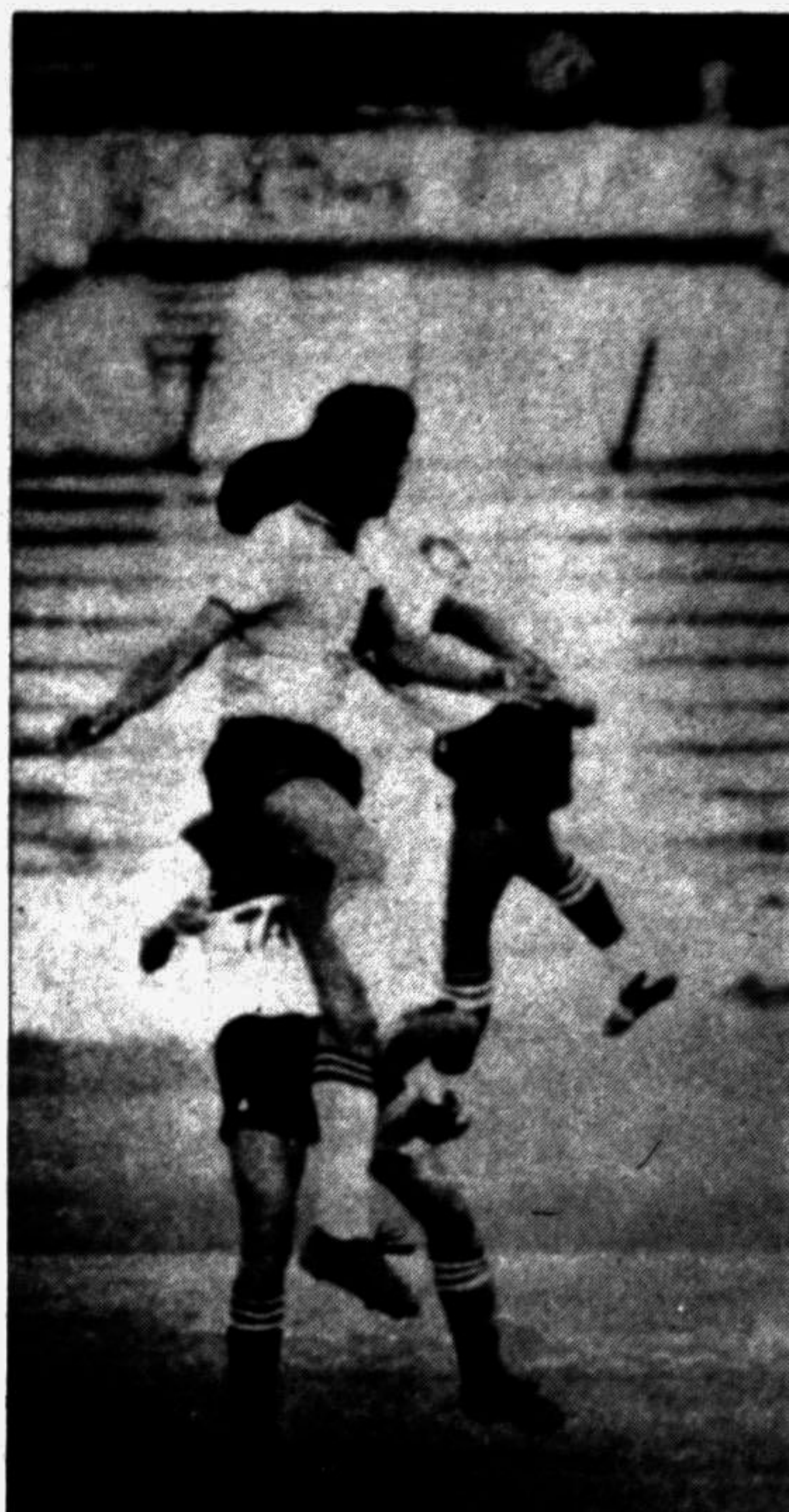
Dhanmondi and BRTC players clash for the control of the ball in yesterday's Fed Cup match at Dhaka Stadium. Dhanmondi won 3-1 on penalties to move into second round.

The addition of Scottish international midfielder Gary McAllister and Central defender Chris Whyte to an injury list which includes inspirational skipper Gordon Strachan, Chris Fairclough and Rod Wallace will test Leeds'