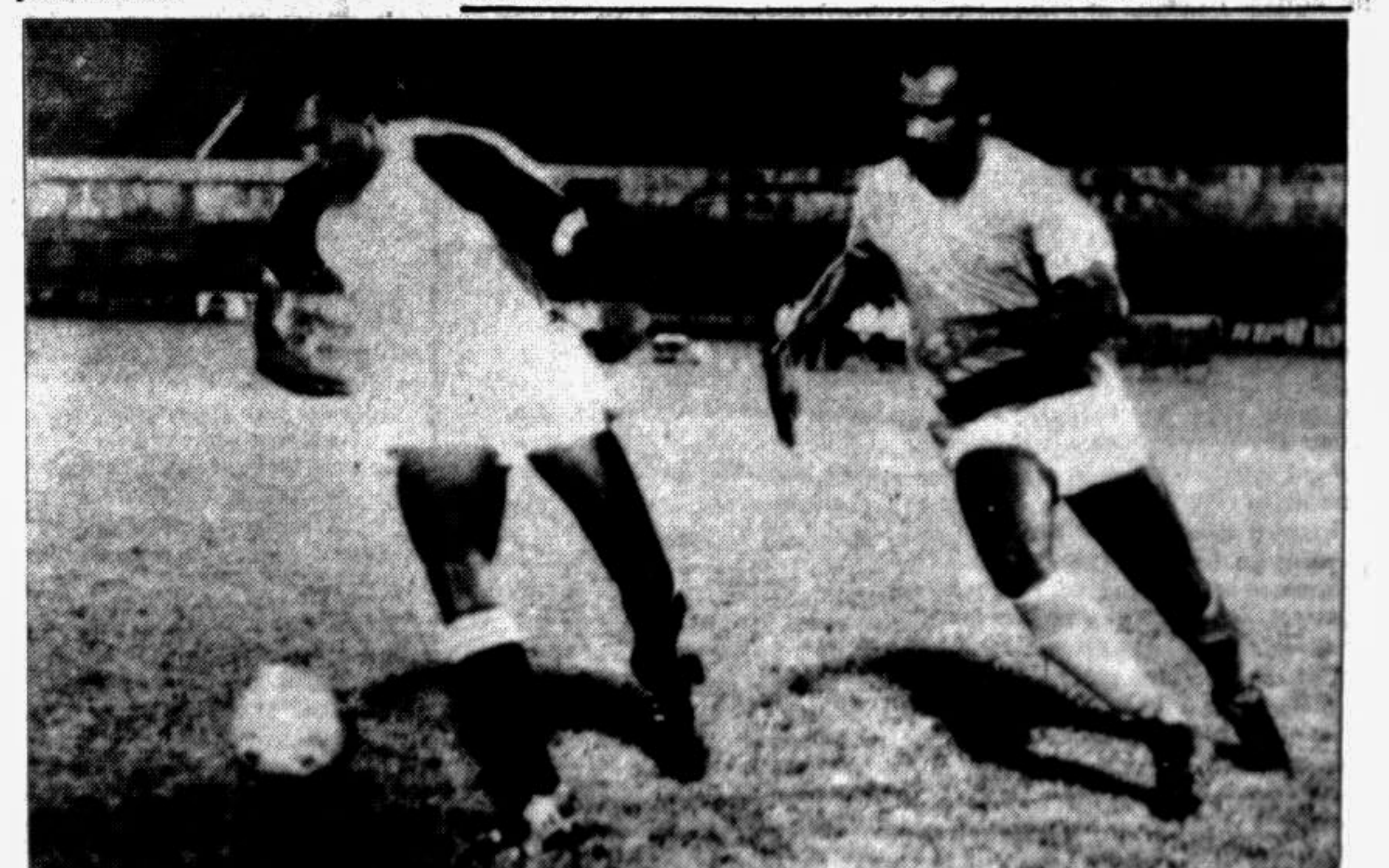
Action from yesterday's Fed Cup match between Dhaka Wanderers Club and PWD SC at Dhaka Stadium yesterday. Wanderers won 4-3 in tiebreaker.