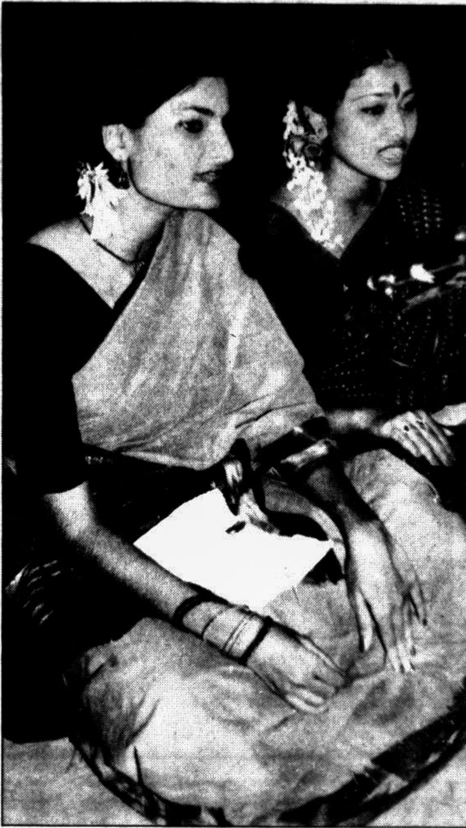
Members of Hrishis Shilpi Gosthi reciting poem at the conference of Kanthashilan — a cultural organisation — at the auditorium of Public Library on Friday.