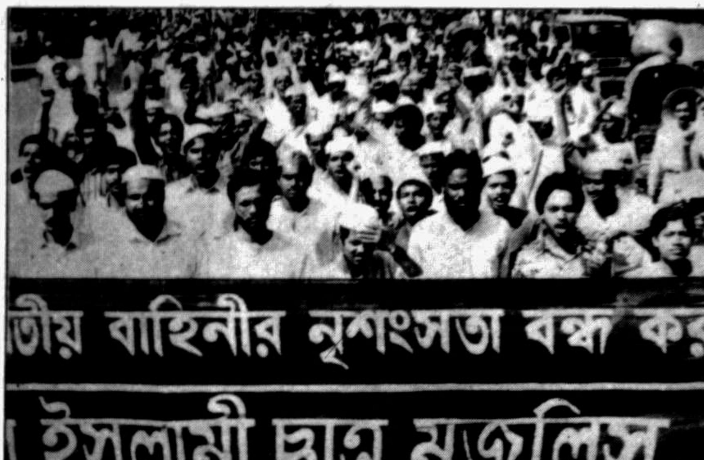
Islami Chhatra Majlish brought out a procession in the city on Friday in protest against the brutality of Indian troops in Kashmir.