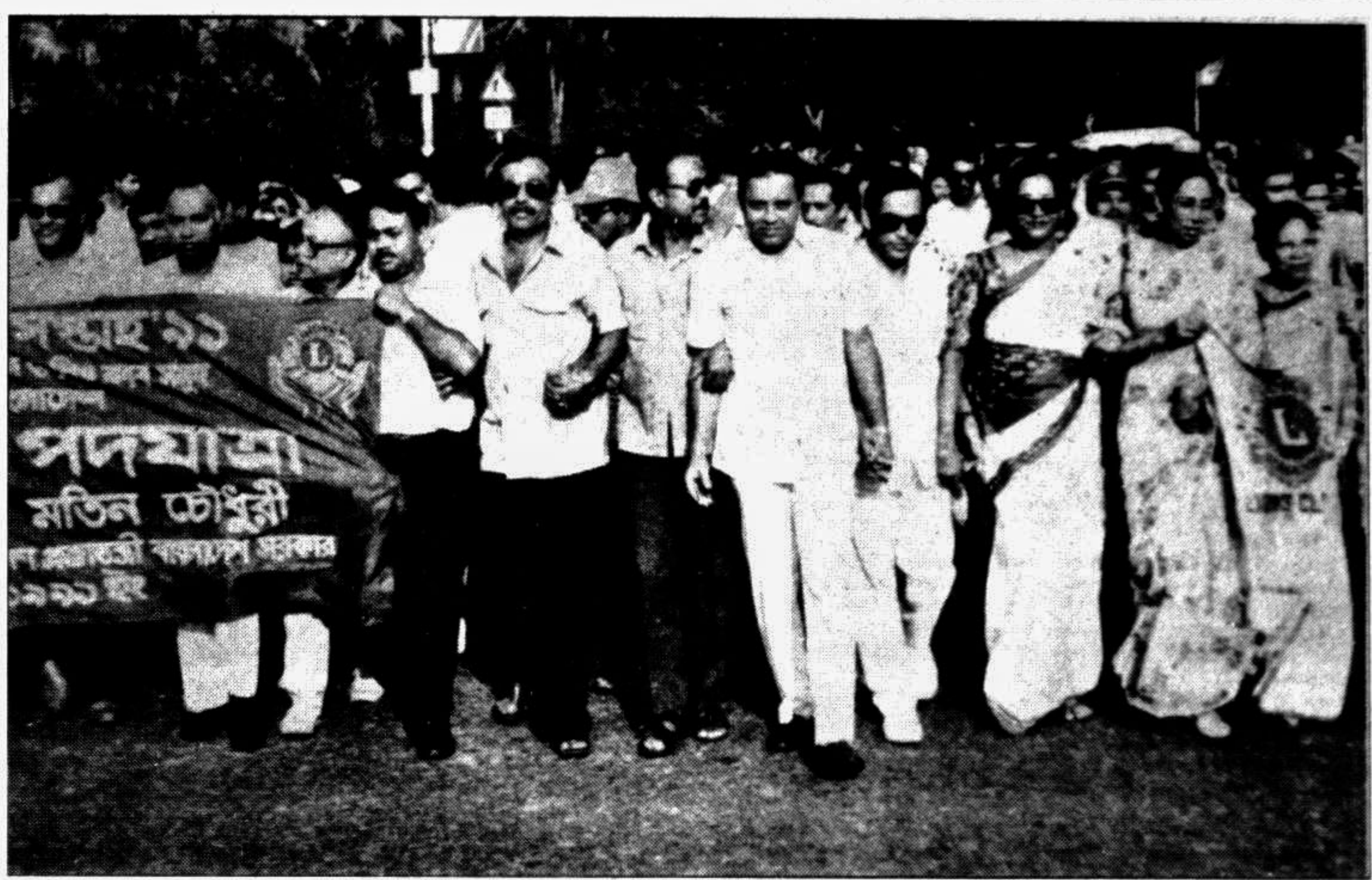
An anti-drug procession was organised by different Dhaka-based Lions, Lioness and Leo Clubs in the city yesterday. Home Minister Abdul Matin Chowdhury led the procession.

Official cautioned that the liquidity crisis of the BSB would have an adverse impact on the overall investment situation, it being the country's only long-term lending agency.