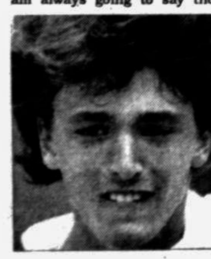
Ivanisevic, who said he lives in Monte Carlo for tax purposes, said he was prepared to give financial support to the Croatian cause.

"My father is already giving some money and I'm going to give more for sure, going to support, with money, whatever I can, freedom of Croatia."