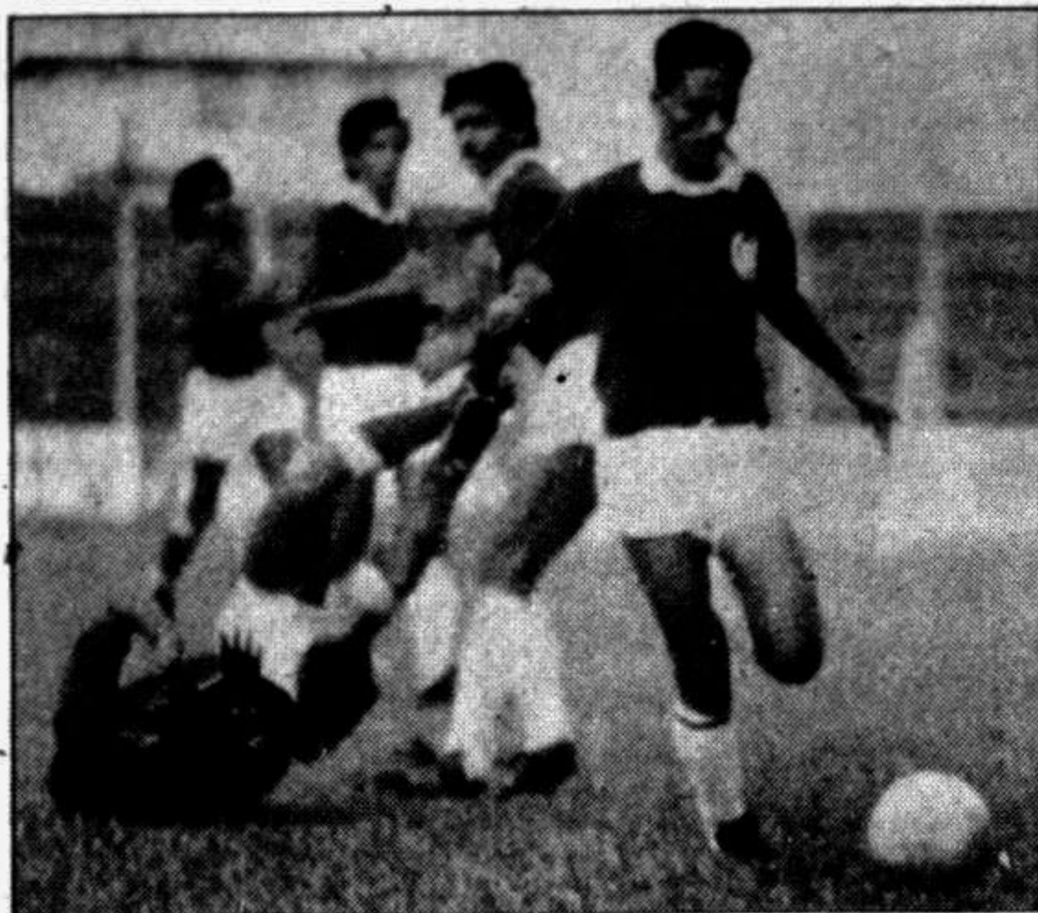
Actions from first of yesterday's Fed Cup 1st round matches between Victoria SC and Rahmatganj MFS at Dhaka Stadium. Victoria won 1-0.