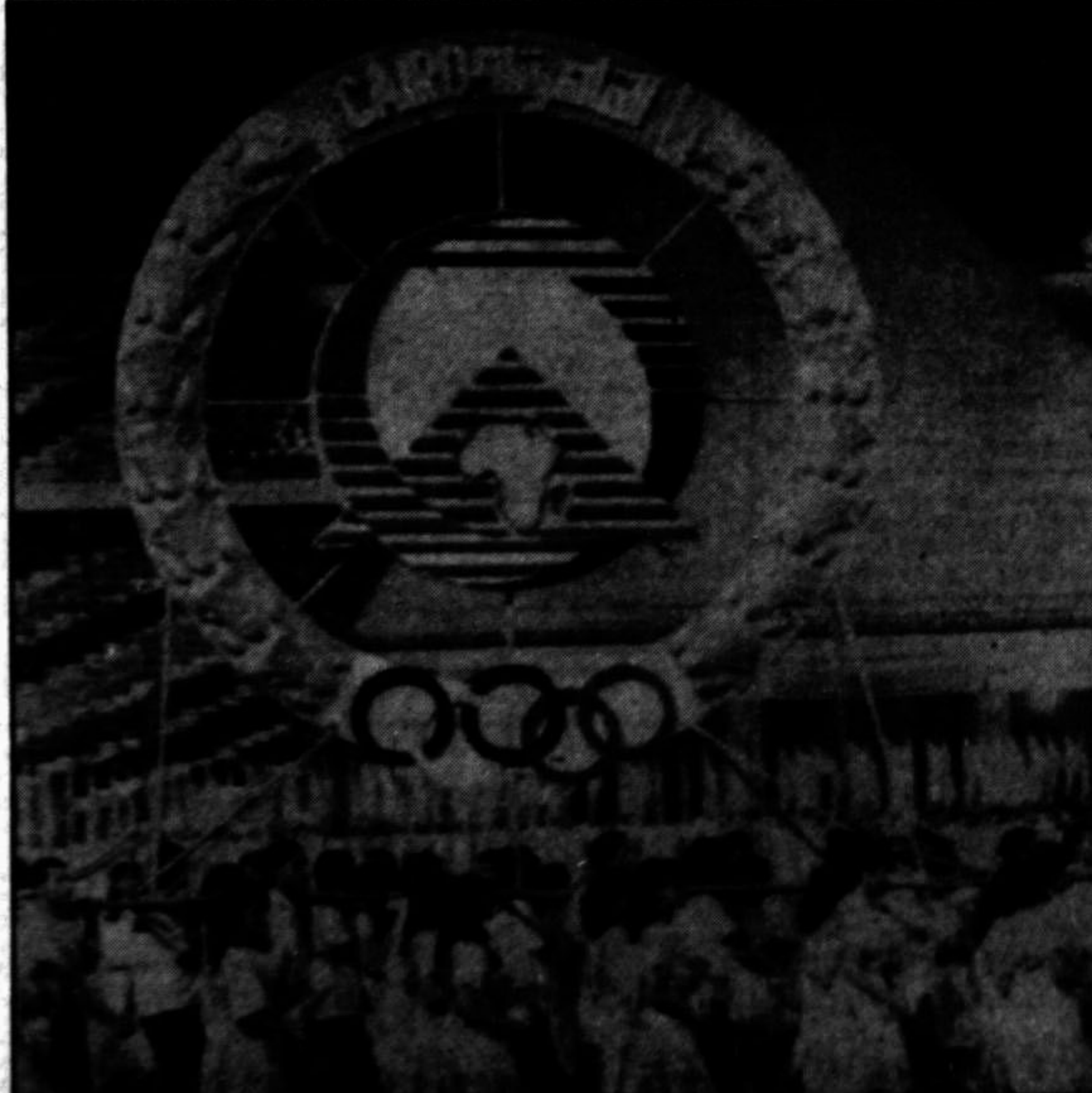
Games emblem: A gigantic replica of the Pan Africa Games emblem is carried into the National Stadium in Cairo during opening ceremonies on September 20.