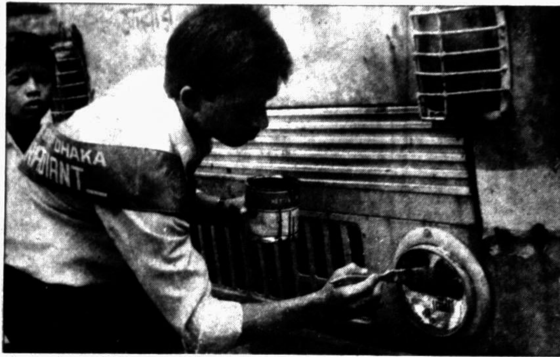
Leo member in Dhaka on Tuesday painting the upper portion of automobile headlights black in their bid to help protect environment.

Emphasising the need for encouraging private sector participation in aquaculture the workshop suggested providing institutional and financial support to create a positive investment climate. It recommended adoption of technologies for intensive rearing fingerlings in nursery cases, pens and enclosures as well as study and monitoring of environmental and biological aspects of stocking of exotic species. The workshop further recommended that floodplain stocking should be supported by effective programmes of conservation and protection with a view to over preventing over-fishing and fishing of under-sized fish. The fishermen should be involved in these efforts, it concluded.