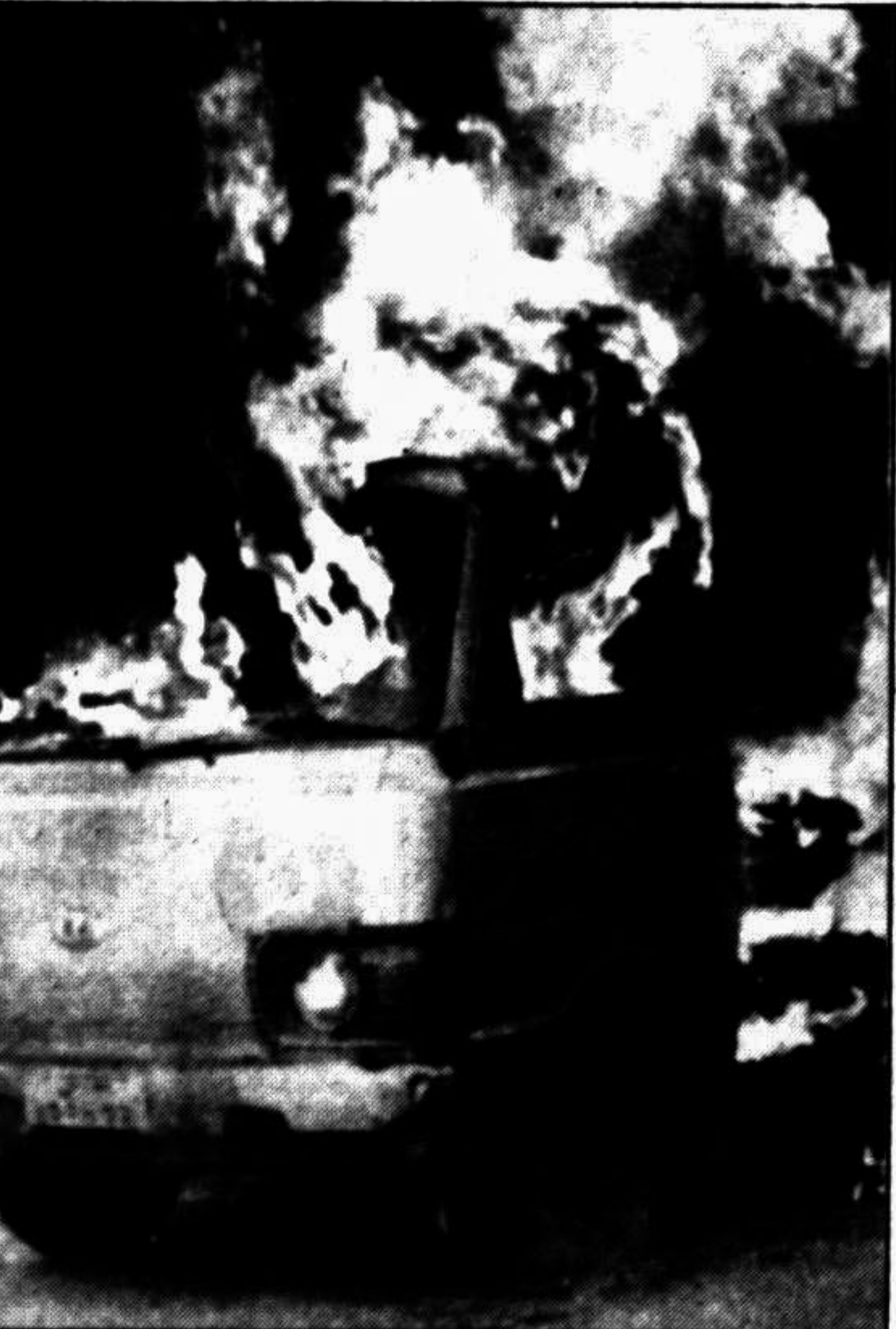
A United Nations microbus is burning as a group of Awami League protestors set fire to it near the Foreign Office yesterday.

By Staff Correspondent Promulgation of the President Election (Amendment) Ordinance checking floor-crossing in the presidential election has evoked widespread reaction from opposition political parties and groups. They have demanded its immediate repeal. The Ordinance, promulgated by the Acting President Shahabuddin Ahmed on September 28, amends the Election of President Act 1991. It states that the election of President by Members of Parliament will be treated as proceedings of the House and the provisions of Article 70 of the Constitution against floor-crossing will be applicable. In a joint meeting of Awami League, Jamaat-e-Islami, Jatiya Party, CPB, NAP and Ganatantri Party Tuesday, the leaders of the opposition called upon all Members of Parliament, irrespective of political affiliations and other political and democratic forces to voice their protest unitedly against the 'unholy and undemocratic' steps of the government. The opposition parties and groups yesterday sat in a meeting with Deputy Leader of the Opposition Abdus Samad Azad in the chair at the Sangsad Bhavan to decide about the follow-up action when the Chief Justice of the Supreme Court refused to set up a special division bench during vacation to hear the writ petition against the Ordinance. See Page 12 Col. 7