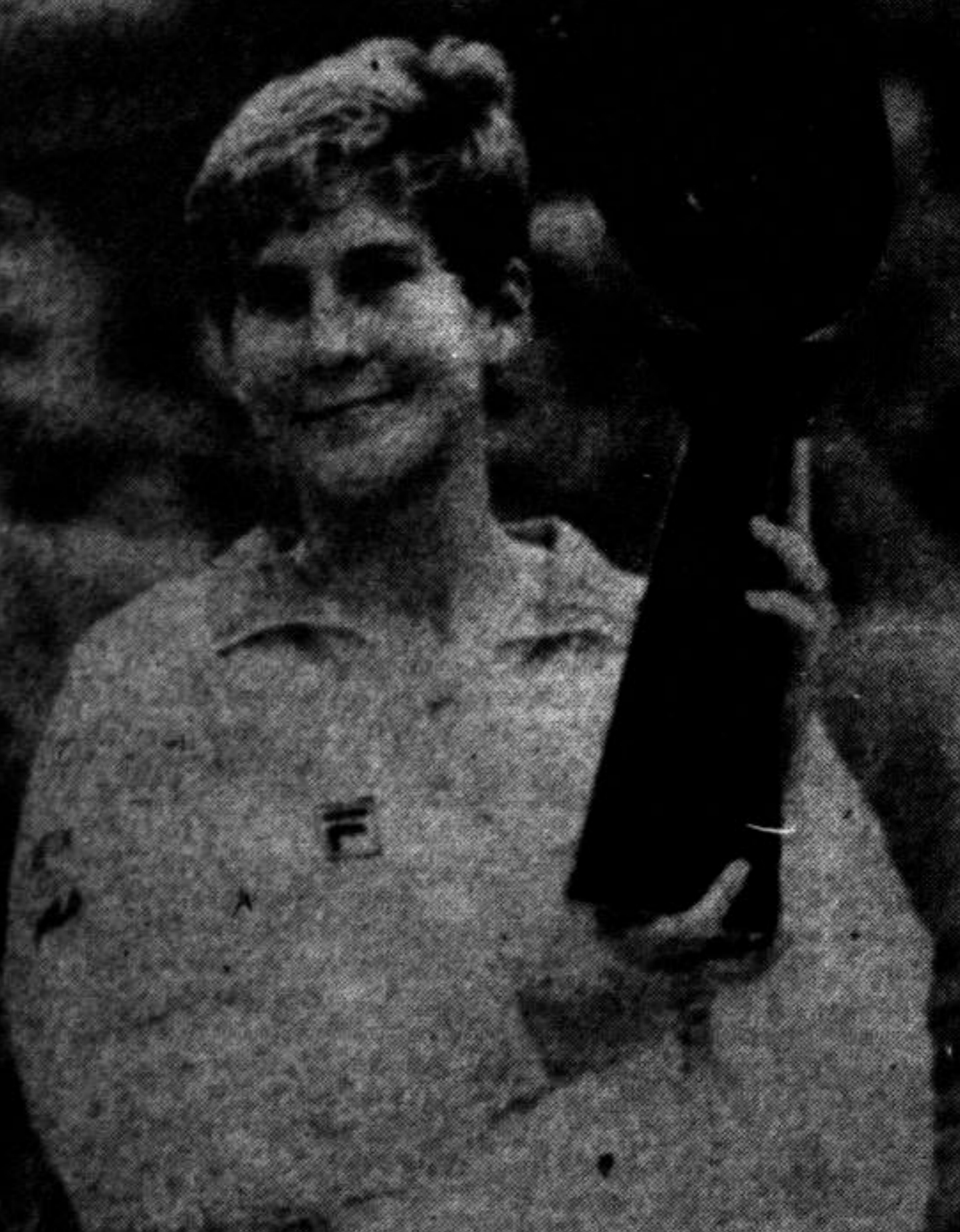
Seles proudly shows off her latest trophy after beating America's Mary Joe Fernandez in two straight sets in the final of the Nokia women's masters tournament in Essen, Germany on Sept 29.