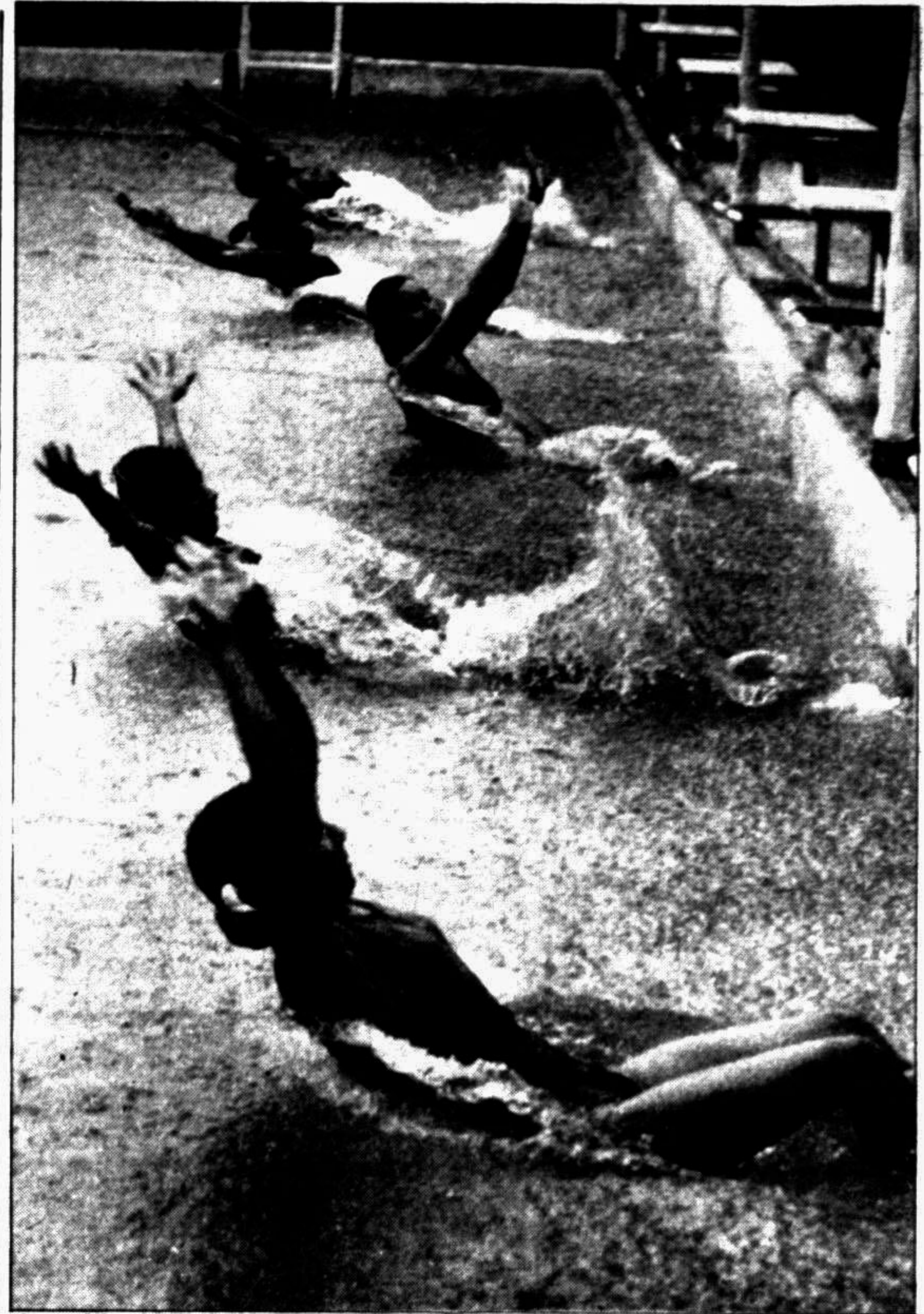
Start of the girls between 13 and 14 years backstroke event yesterday.

She gained the distinction by trying for first place in the candidates matches and then winning a seven-game play-off against Alisa Maric in Belgrade and Beijing in February.