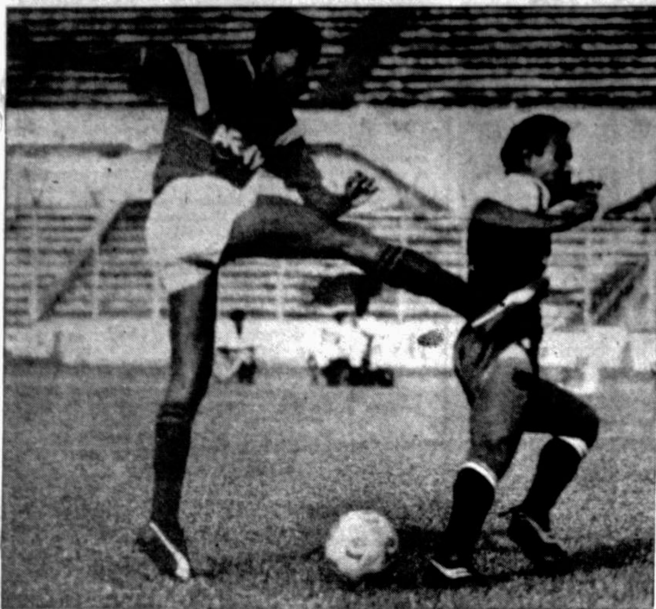
Action from yesterday's Fed Cup first round match between Bangladesh Army and newcomers Police at Dhaka Stadium. Army won 10-2.