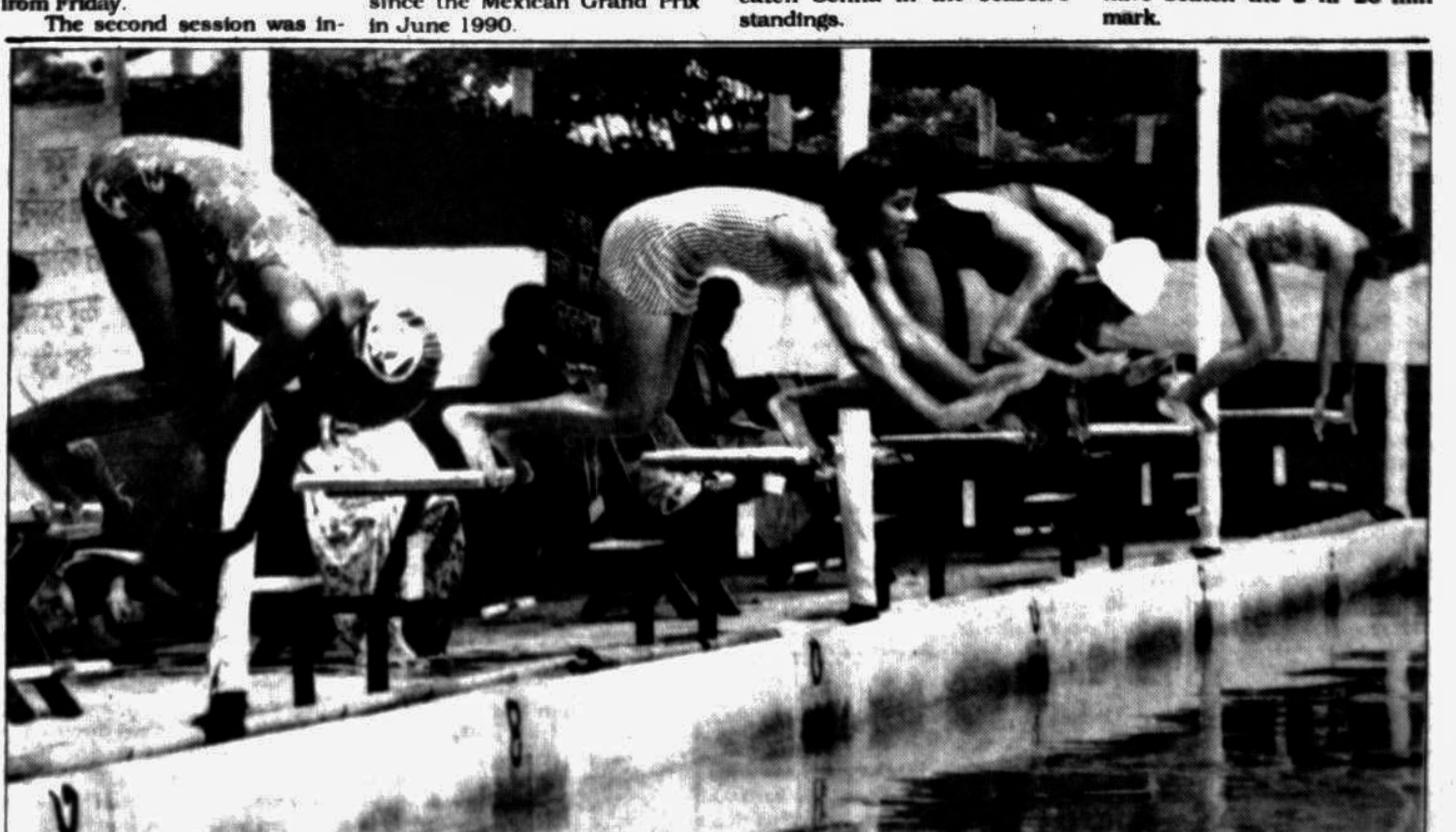
Start of the women's 200m breaststroke at the Women's Complex pool yesterday.

Nine of those of competing have beaten the 2 hr 20 min mark.