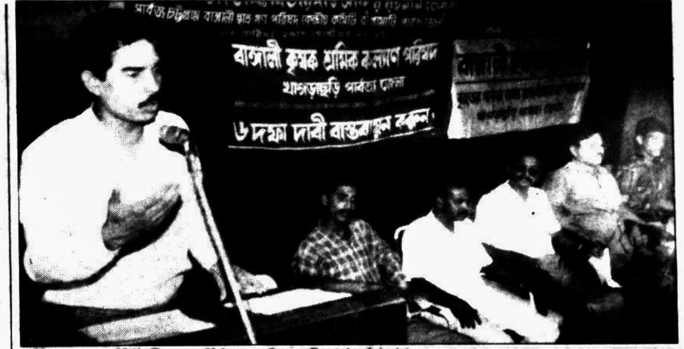
Chittagong Hill Tracts Chhatra-Gana Parishad held a seminar on 'Bangalee and Tribal Problems of the Chittagong Hill Tracts and the Present Bangladesh' at Teacher-Student Centre of DU Friday.

Rain or thundershower is likely at many places over Chittagong division and at a few places over Dhaka, Rajshahi and Khulna divisions during the next 24 hours ending 6 pm Saturday, reports UNB. Met office said day temperature may rise by 1-2 degree Celsius over the country. Meanwhile, Chittagong experience the highest 50 mm rainfall during the last 12 hours till 6 pm Friday. Rangamati and Dinajpur had 19 mm each, Cox's Bazar 7, Sitakund 3 and Bogra 1 mm shower during the period. Friday's maximum temperature in Dhaka was 30.3 degree Celsius and the minimum 24 degrees. Rajshahi recorded the highest temperature 33.5 degree Celsius while Mymensingh the lowest 21.9 degrees. Percentage of humidity was 83.1 both in the morning and evening. Sun sets today (Saturday) at 5.50 pm and rises tomorrow (Sunday) at 5-50 am.