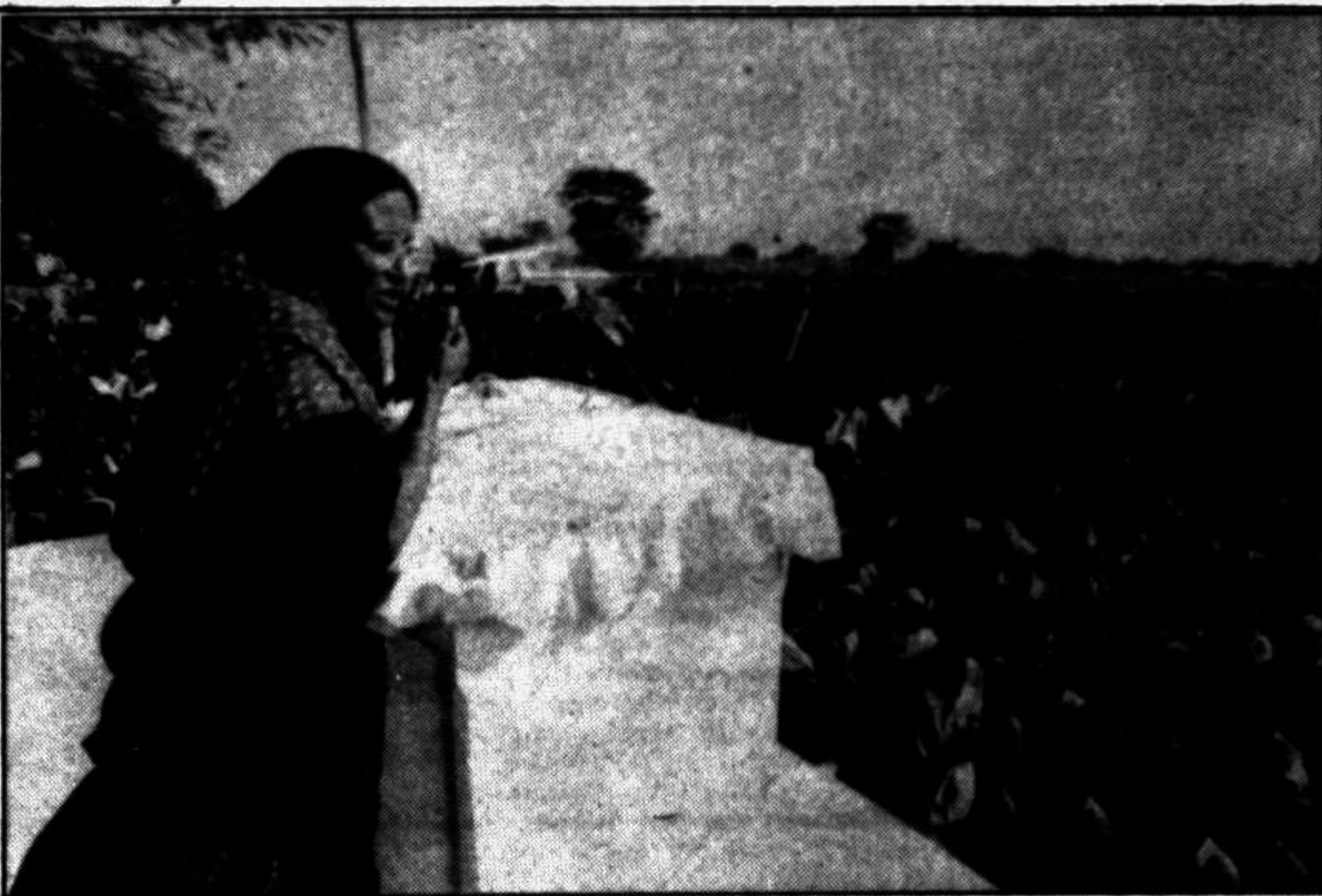
Awami League leader Sheikh Hasina addressing a public meeting at Nekmarod, Thakurgaon on Sunday.