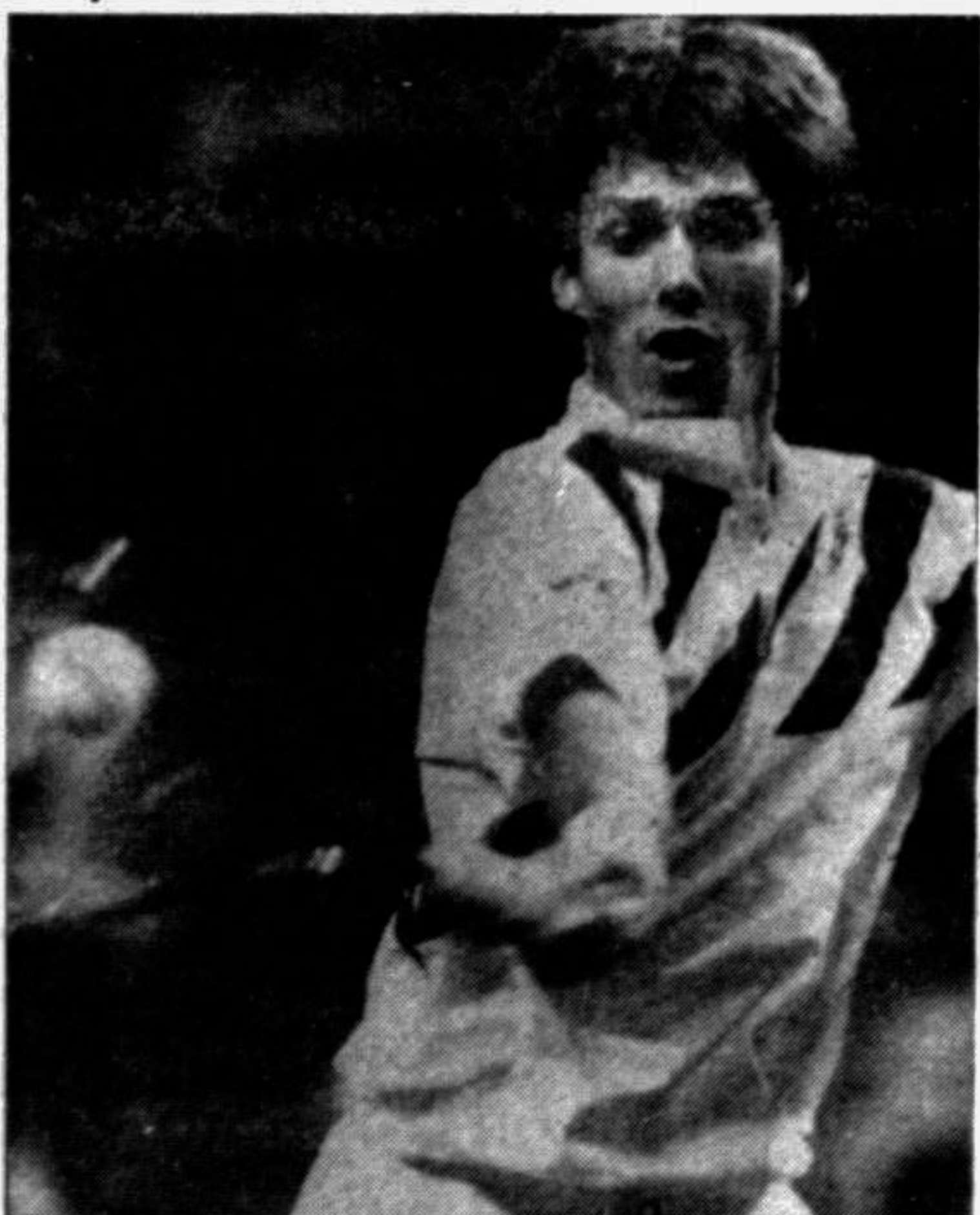
Michael Stich of Germany returns the ball during his Davis Cup semifinal match with American Jim Courier on September 22 in Kansas City. US took an unbeatable 3-1 lead and will face France in final.

serve for the first six games. "From the very first point it was obvious Andre was on. There was never any doubt," said US captain Tom Gorman after the 29-time champion United States reached their 56th Davis Cup final. Agassi, loser of all three of his Grand Slam final appearances, admitted he had shied away from pressure in the past, but said he was ready on Sunday.