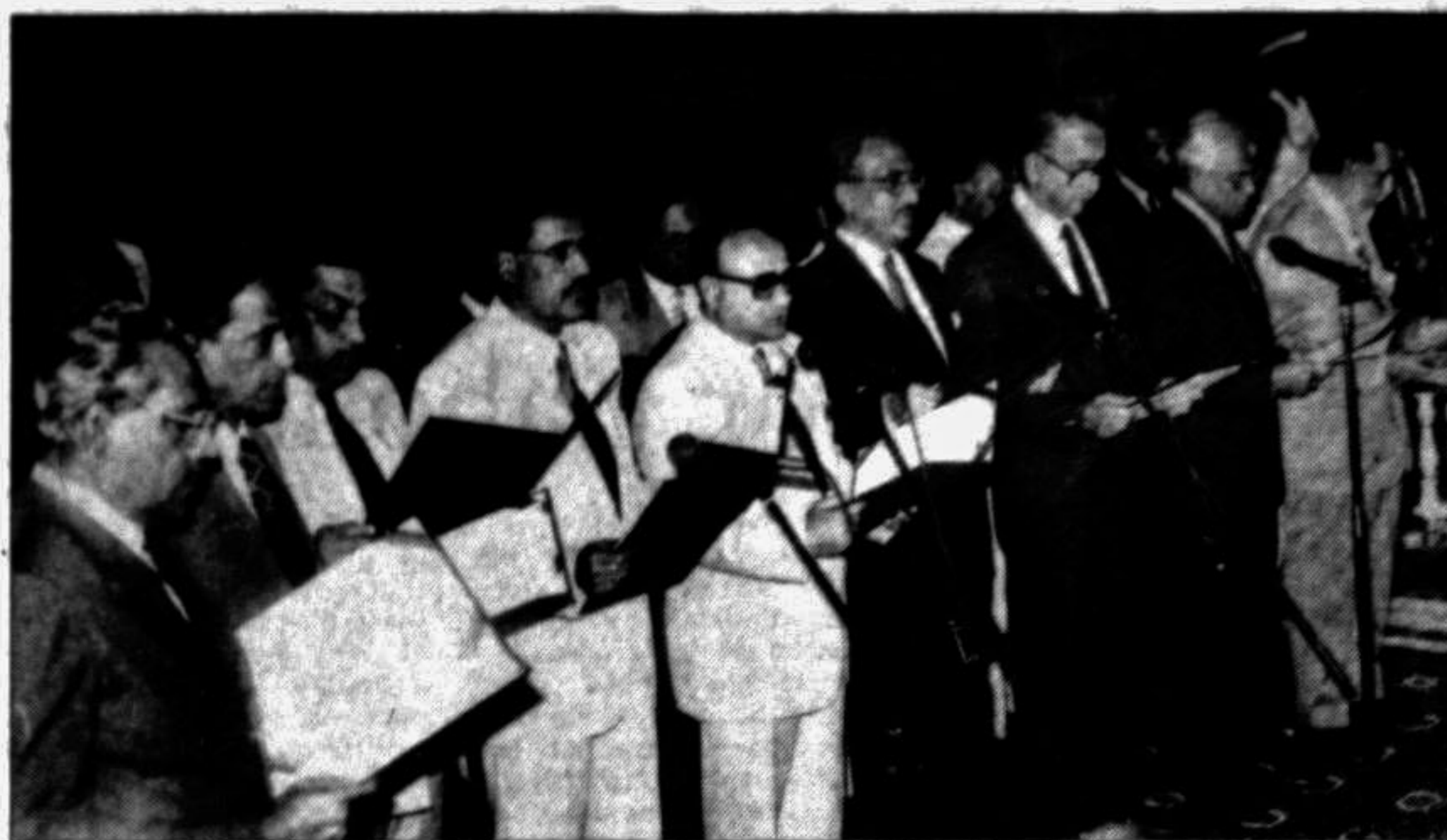
Cabinet ministers (above) and state ministers (below) being sworn in at Bangabhaban yesterday.

An official of the DCC told the Daily Star that concerted effort to weed out factories from residential areas by the relevant agencies was always lacking. The DCC takes initiative in case of specific complaints but the result is not satisfactory for so many factories, he added.