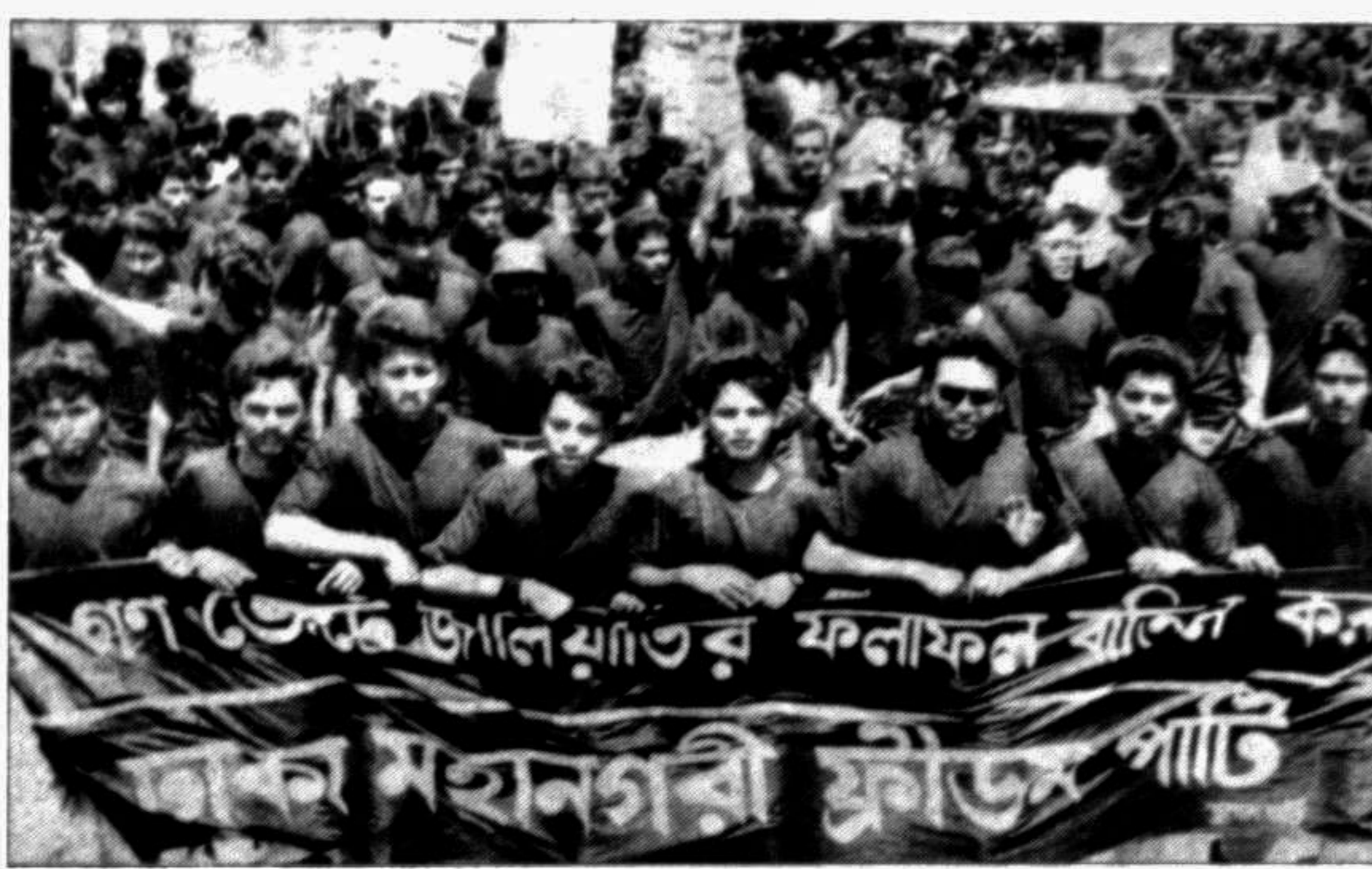
City unit of Freedom Party brought out a procession on Wednesday demanding scrapping of result of referendum.

These malpractices have stunned the nation, Khan observed.