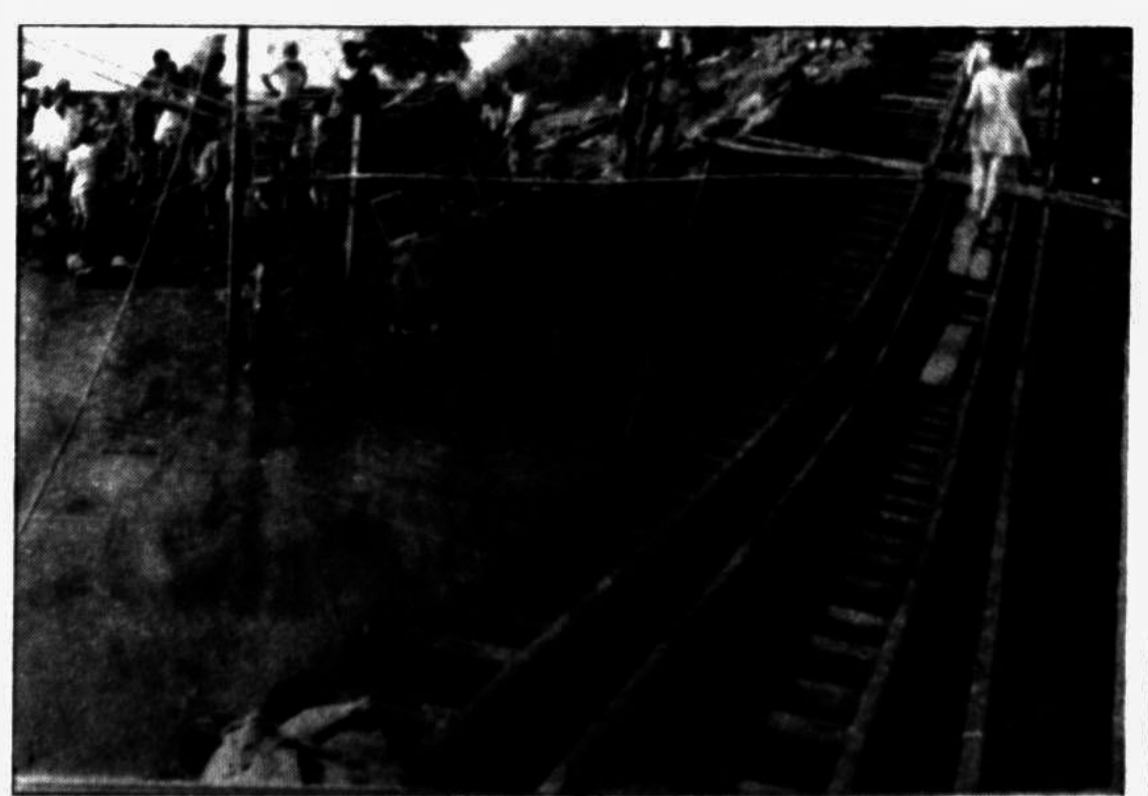
Railway Engineers and workers are engaged in repairing a flood damaged rail-bridge on Teesta-Kurigram section.

Meanwhile, the Bangladesh Mahila Parishad, Kurigram Zila Unit, arranged a press conference at Kurigram and president of the Parishad demanded exemplary punishment to the culprits.