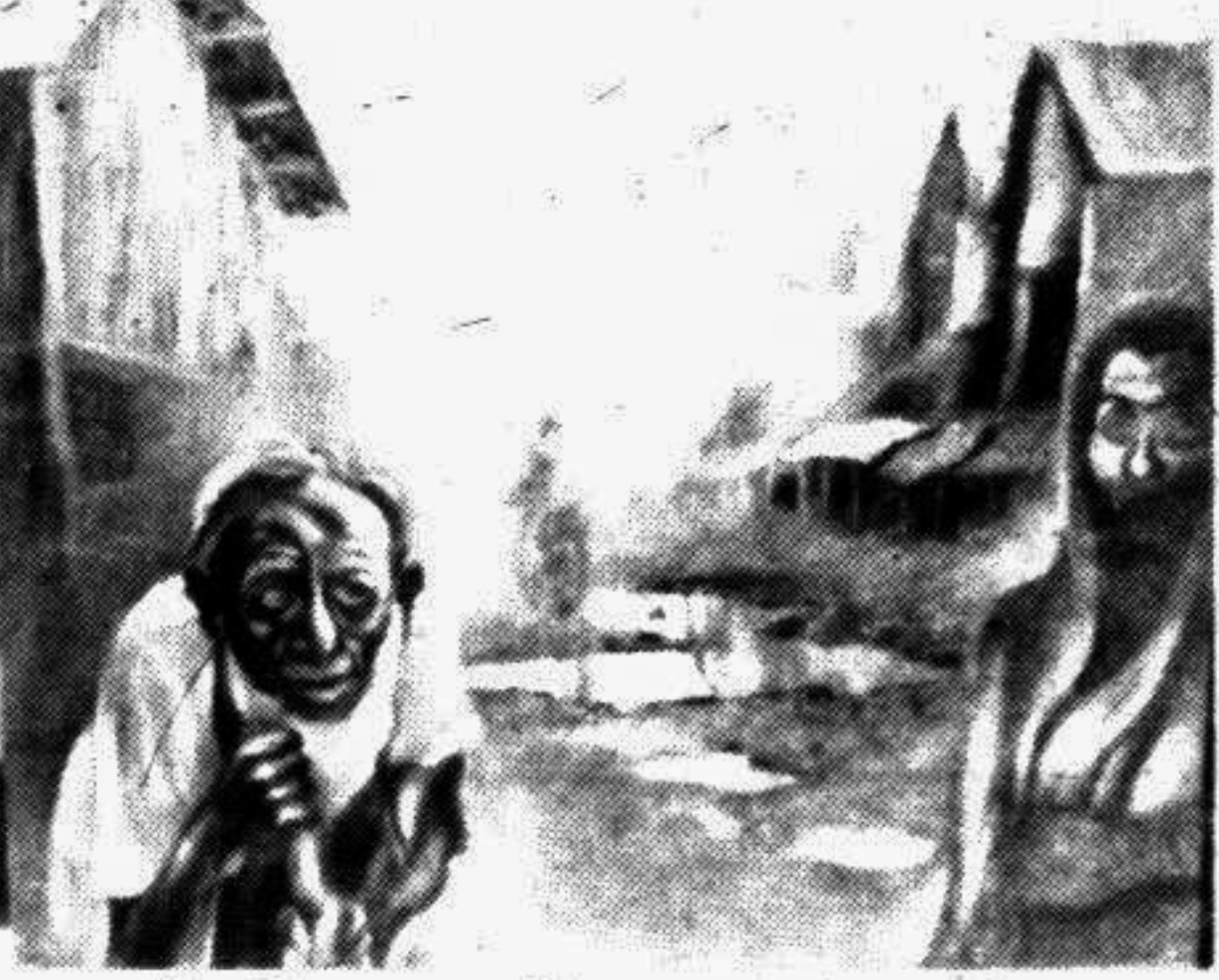
Wealth on one side, poverty in another.