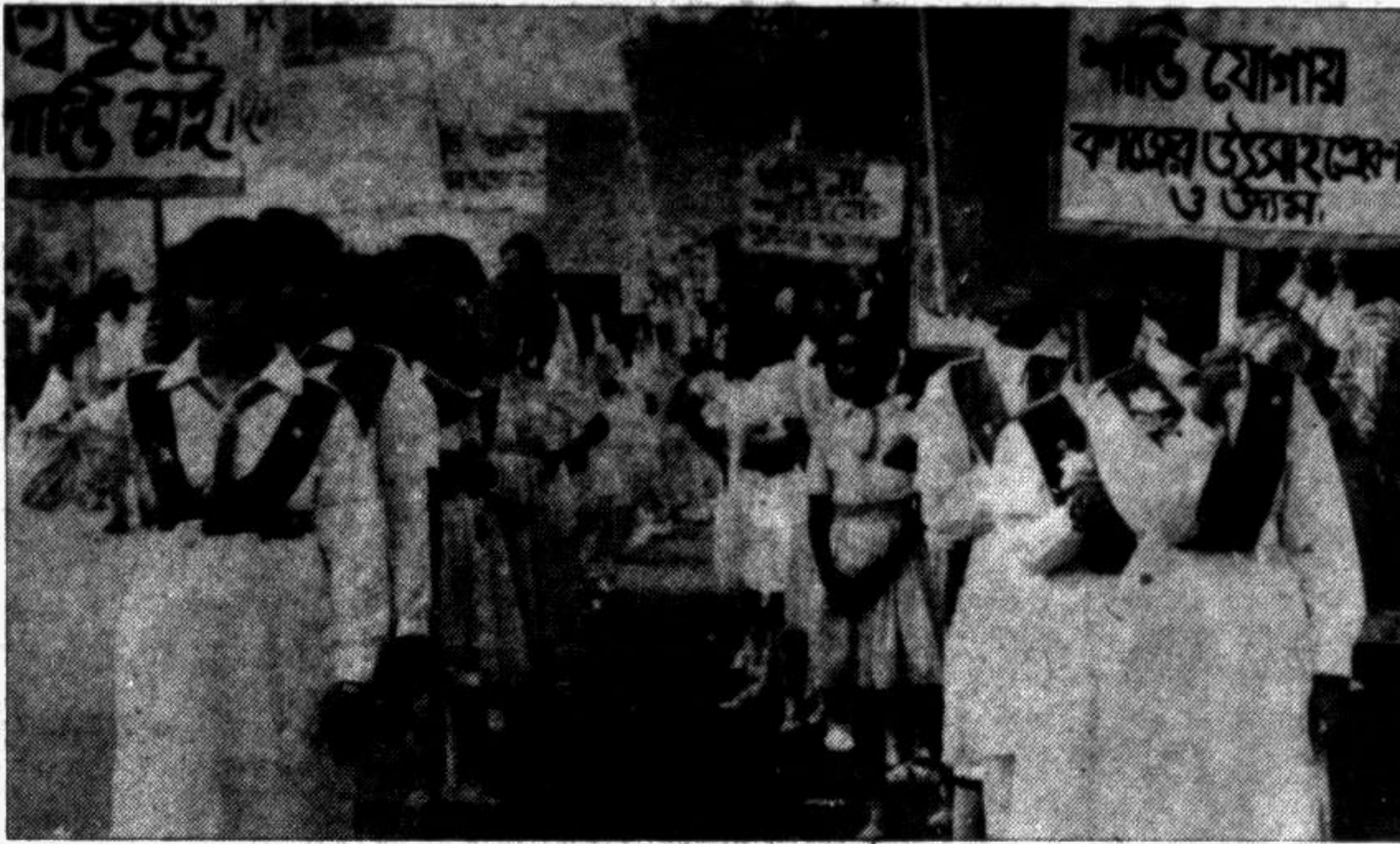
School girls brought out a procession in the city on Wednesday in observance of International Day of Peace.