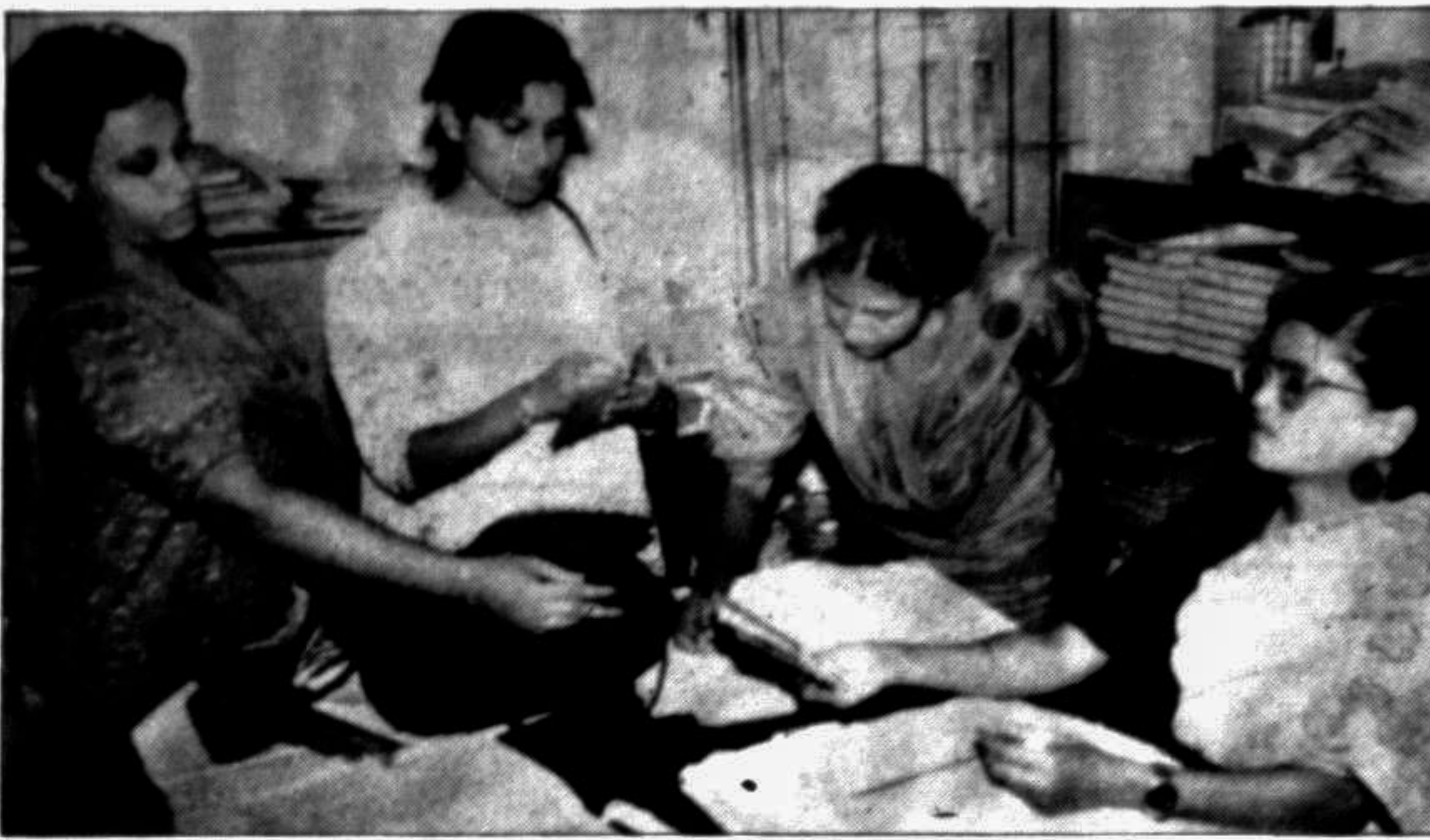
Students of Rokeya Hall of Dhaka University showing their identity cards before entering the hall on Monday.