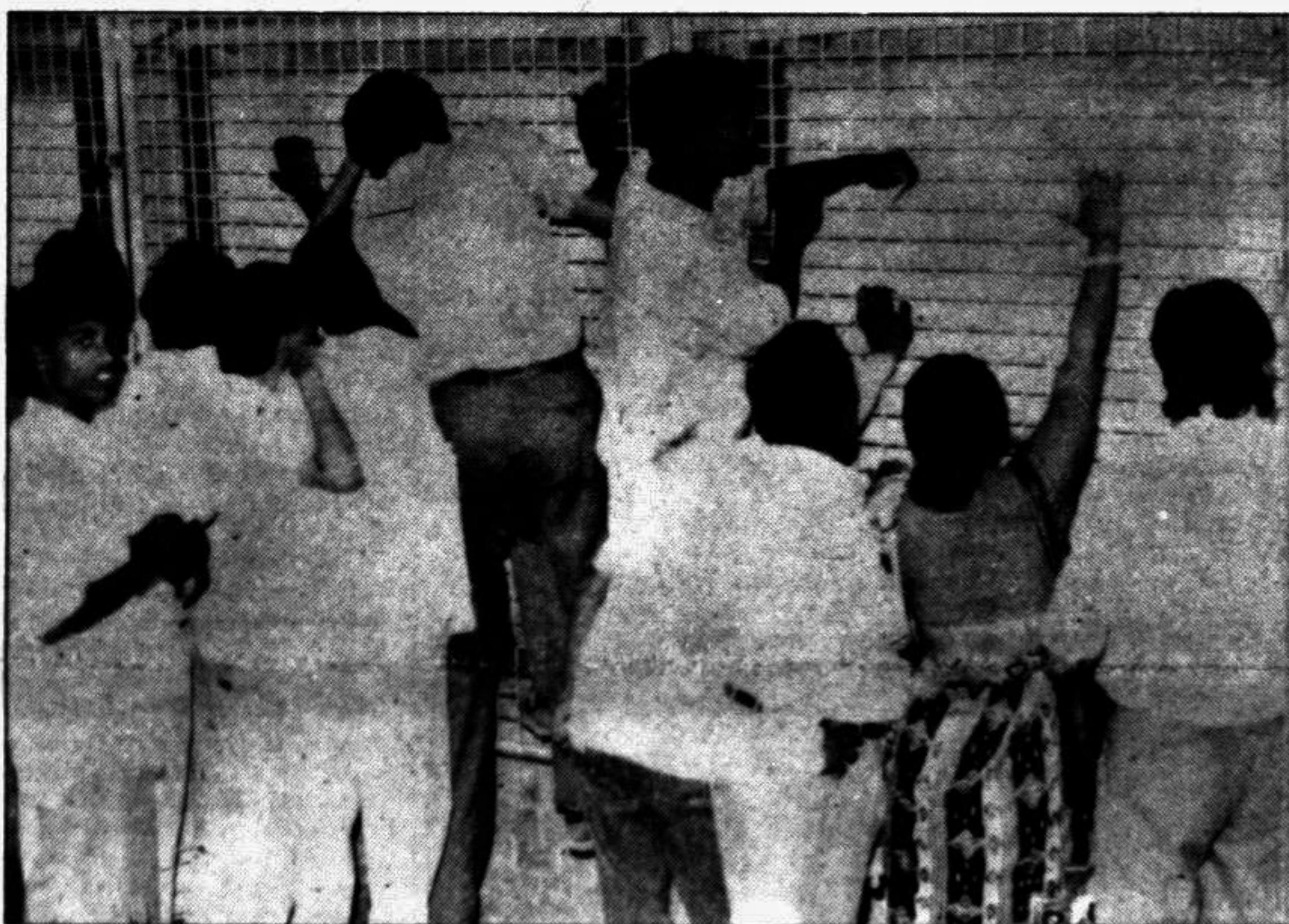
Frenzied SSC examinees and also their guardians crowding at the gate of Dhaka Board as they came to know that results were announced yesterday afternoon.