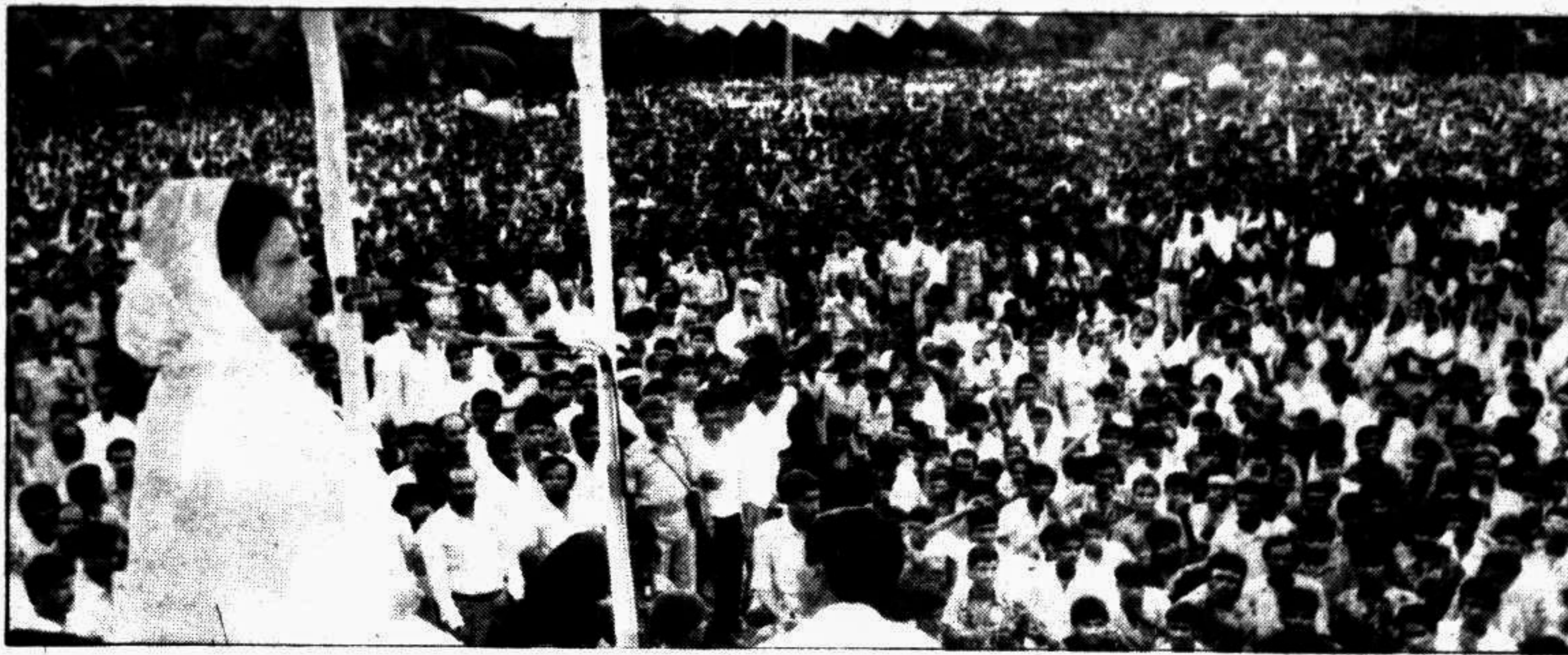
Prime Minister Begum Khaleda Zia addressing a big public meeting at Hatir Bagan field in Shibchar upazila of Madaripur district on September 5.

Police seized the truck but the driver fled. A case has been filed in this connection.