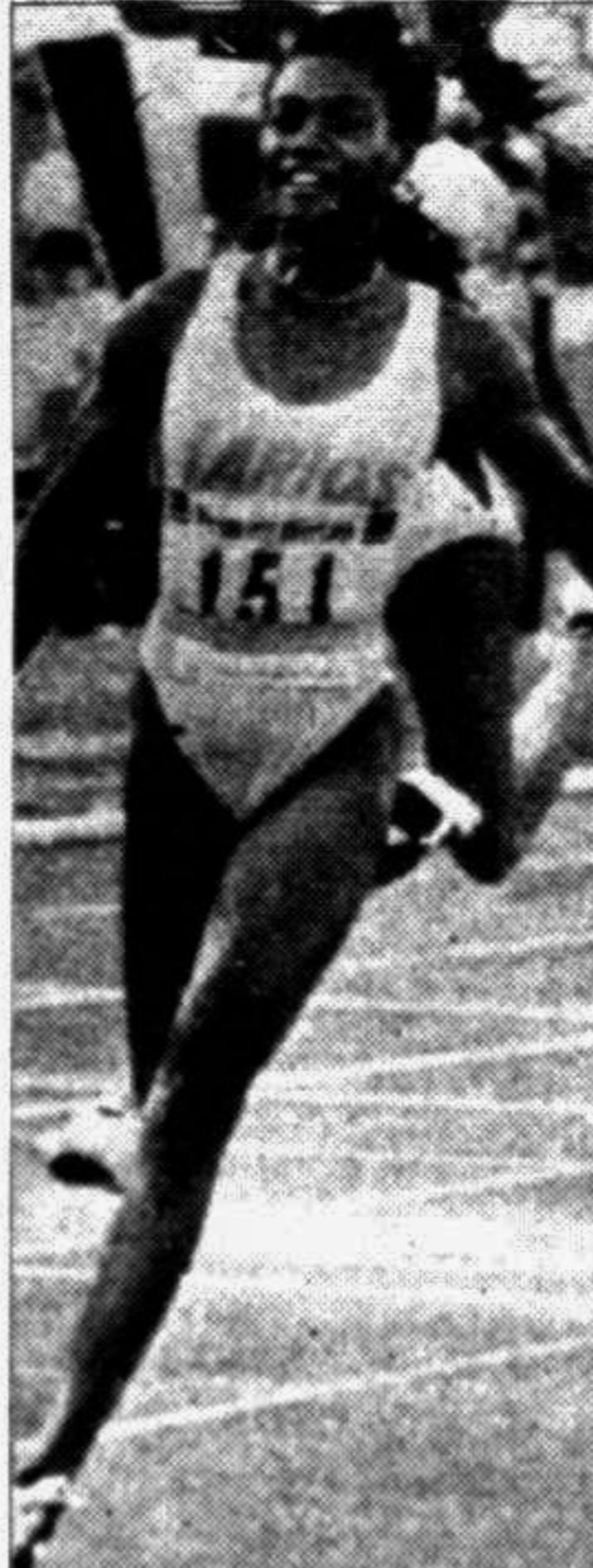
OTTEY...a winner again Despite coolish, overcast conditions which were poor for sprinting, the 21-year-old former East German made a superb start and looked to be in control after 70 metres.

COLOGNE, Germany, Sept 9: Germany's double world sprint champion Katrin Krabbe suffered a surprise defeat over 100 metres at the Cologner Grand Prix athletics meeting on Sunday, reports Reuter. Krabbe, who triumphed in both the 100 and 200 metres, at last month's World Championships in Tokyo, finished second behind American Gwen Torrence, the world silver medalist in Japan over both distances.