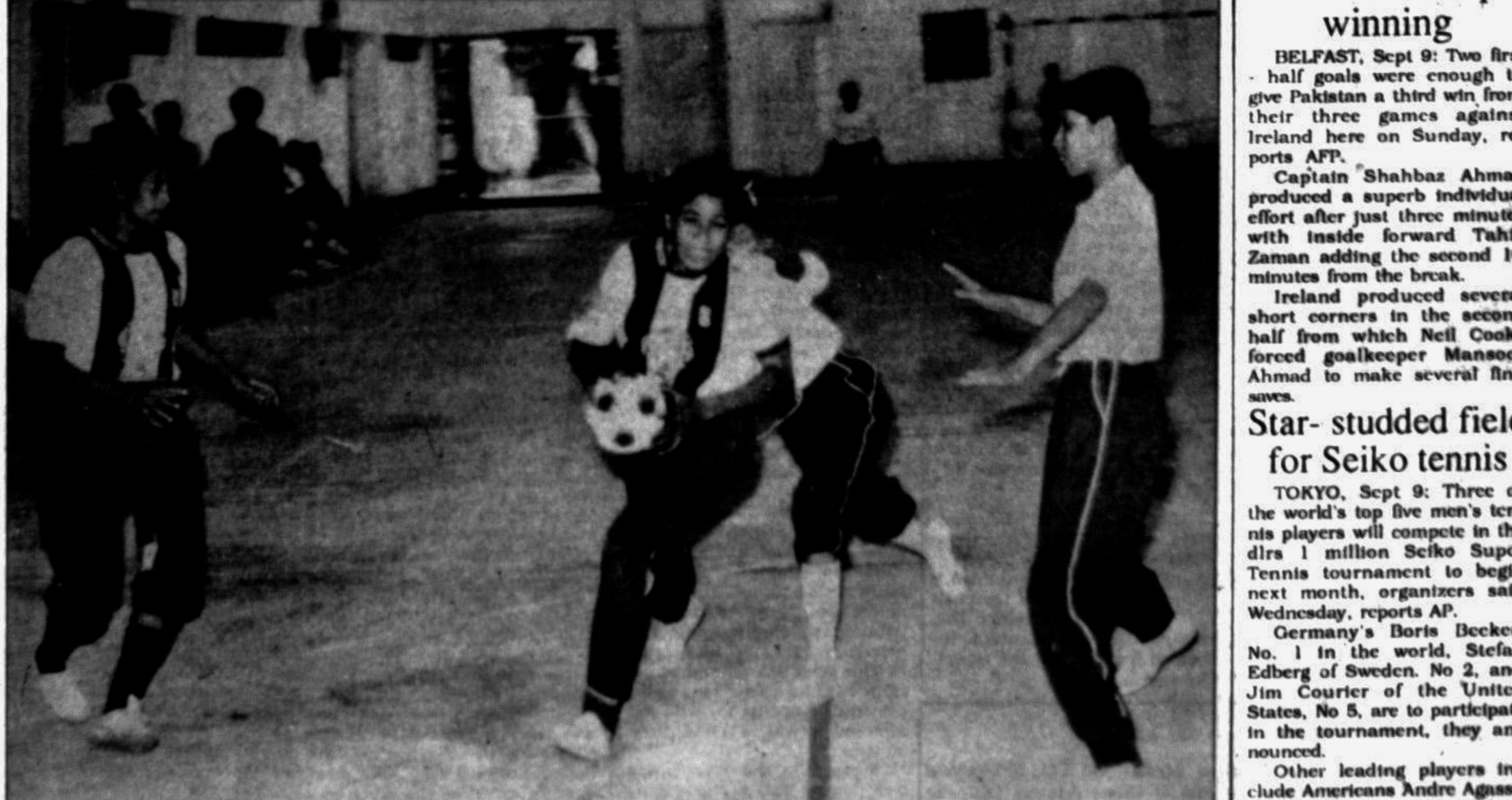
Action from the Jessore versus Chapni Nawabganj match on the opening day of the Karnaphuli Insurance women's handball tournament at the Dhanmandi Women's Sports Complex yesterday. Seven teams are taking part in the meet organised by the Bangladesh Women's Sports Federation.

Star-studded field for Seiko tennis TOKYO, Sept 9: Three of the world's top five men's tennis players will compete in the first million Seiko Super Tennis tournament to begin next month, organizers said Wednesday, reports AP. Germany's Boris Becker, No. 1 in the world, Stefan Edberg of Sweden, No. 2, and Jim Courier of the United States, No. 5, are to participate in the tournament, they announced. Other leading players include Americans Andre Agassi, David Wheaton and Michael Chang. The men's singles winner earns $122,700. The tournament is to begin on Oct. 7.