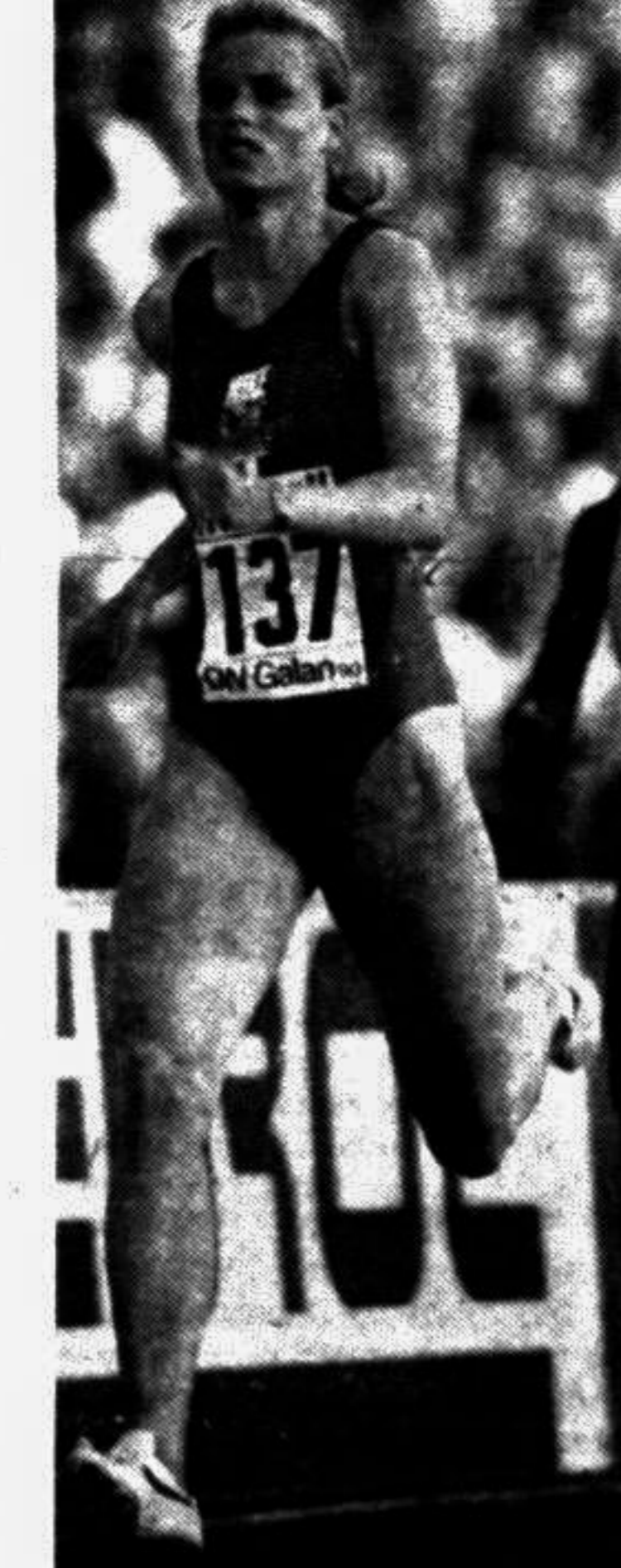
KRABBE...a debacle It is unlikely she will agree to a duel on home ground.

who I should start and how I should do everything differently." The next race is in Berlin. I'm ready to take on Krabbe and it doesn't matter whether it's 100 or 200." Krabbe, who was immediately surrounded by photographers and autograph-hunters when she came into the stadium with her boyfriend before the meet began, said she had found it hard to concentrate on Sunday's race. "After 11 races in Tokyo and all the fuss it's very difficult to motivate yourself," she said. "But I'm happy."