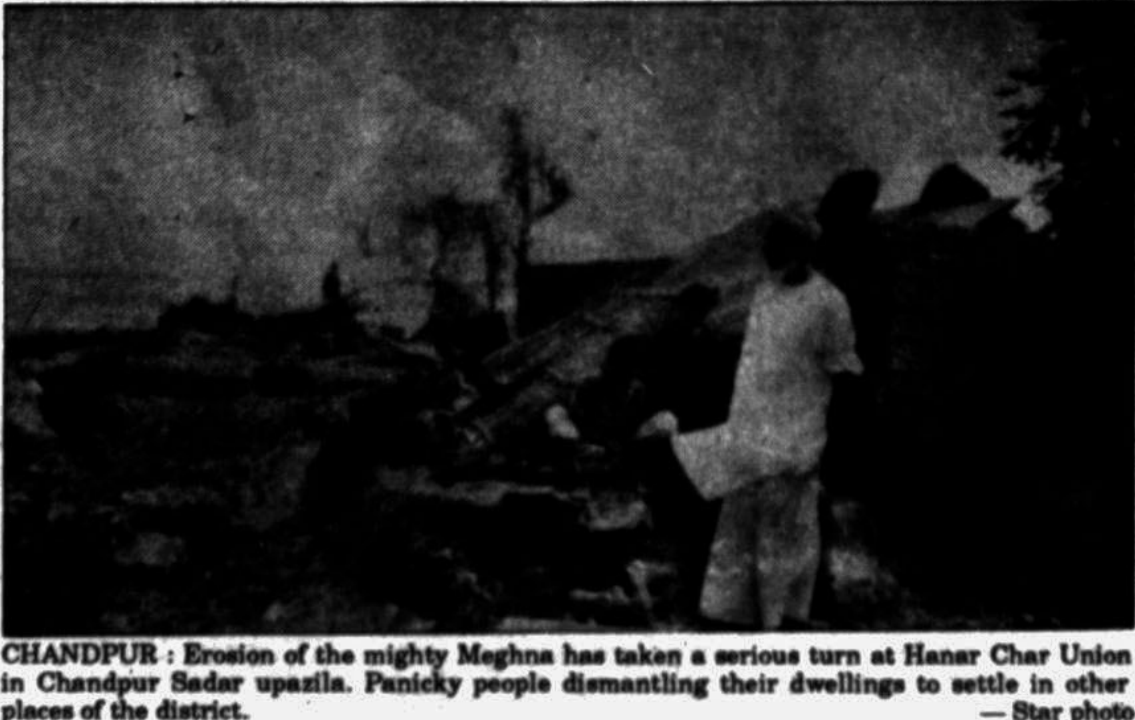
CHANDPUR: Erosion of the mighty Meghna has taken a serious turn at Hanar Char Union in Chandpur Sadar upazila. Panicky people dismantling their dwellings to settle in other places of the district.